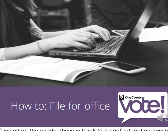
Clicking on the image above will link to a brief tutorial on how to file for office online. The tutorial will be available by April 1.

No filing fees will be refunded, even in the event of a withdrawal.