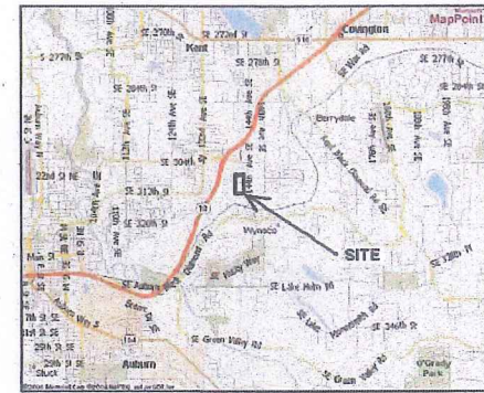
VICINITY MAP NTS