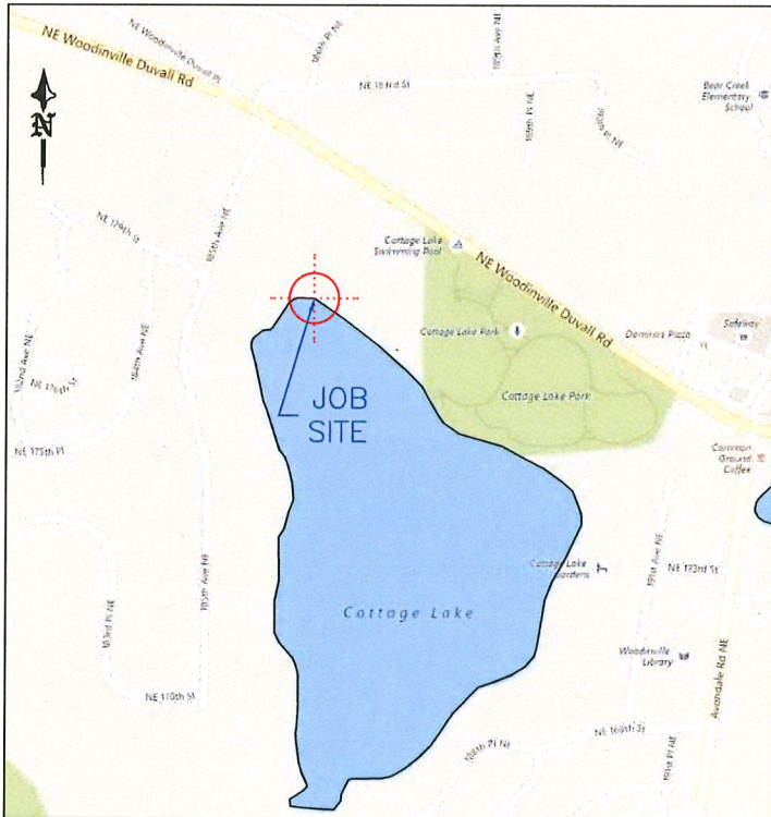
VICINITY MAP/NO SCALE