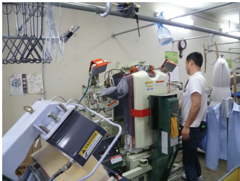
Figure 1. Employee pressing shirts by using two pressing machines in series.

In the shops that we evaluated, the drycleaning machines had enclosed drums where the fabrics being cleaned were saturated with the drycleaning chemical. In all the alternative solvent drycleaning machines we observed in this evaluation, any cleaning additives (e.g., detergent, stain repellent) were injected into the solvent flow line or into the drum of the drycleaning machine (in contrast to an older method that involved predissolving the detergent in the solvent). When the cleaning cycle was complete, the solvent was drained, and the cleaned fabrics were placed under vacuum, heated, and tumbled to remove any remaining solvent. Employees could manually spot-clean fabrics that were still stained or soiled after drycleaning, using the same products used in precleaning. The cleaned fabrics were pressed (Figure 1) and ironed as needed, then hung on hangers and covered with plastic wrapping awaiting customer pick-up.