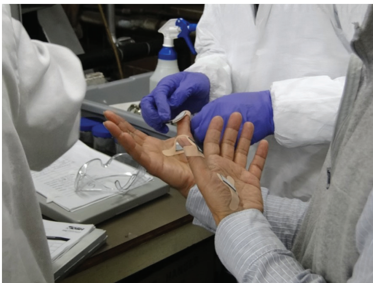
Figure 3. Patch samplers being placed on the owner/operator's hands before he donned protective gloves.

We used patches (PERMEA-TEC™ Sensors for solvents) to determine whether butylal or DF-2000 contacted the hands of employees and owner/operators when they used protective gloves. While wearing nitrile gloves to avoid contamination, we placed four patches on the skin, beneath the protective gloves that were worn during a task (Figure 3). A patch was placed on the palm and one finger of each hand. The patch sample analysis methods for butylal and DF-2000 are described in Appendix D.