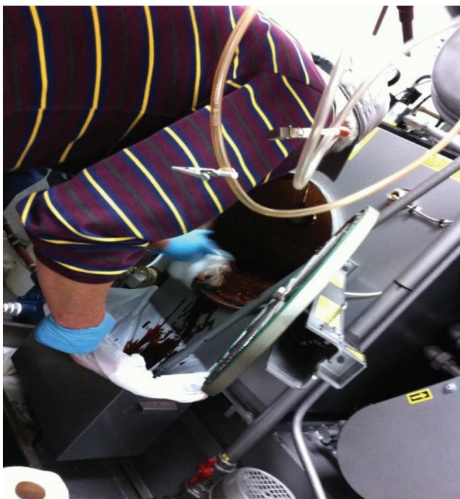
Figure 2. An owner/operator removing still bottoms from the DF-2000 drycleaning machine. Photo by NIOSH.

Modern drycleaning machines prevent the release of solvent vapors to ambient air by recycling the solvent in a closed loop system and automatically evacuating the air in the cleaning chamber before the machine is opened. The heated solvent vapors generated during the drying cycle pass through a refrigerated condenser [LHWMP 2014a]. The condenser cools the air and condenses the solvent vapor to be recovered. Recovered solvent is then pumped into a vacuum still. This distillation process prevents impurities from building up in the solvent. Steam coils in the still heat the solvent to boiling. The solvent vapors flow through a condenser to remove water. This process also generates a concentrated waste material called “still bottoms” that contains residual solvent in addition to nonvolatile components, such as detergent, sizing, waxes, oils, and greases. After the drycleaning machine has cooled (usually overnight), the still bottoms are manually transferred to a waste container (Figure 2) with a specially designed rake, usually by the shop owner. Depending on the volume of drycleaning processed in a shop, the still bottoms are removed every 1–2 weeks.