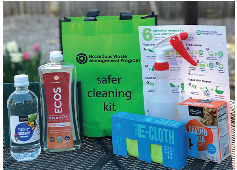
(Safer Cleaning Kit given to each participant)

After conducting a pre-educational visit survey, SHH Promoters delivered a safer cleaning kit to each family. SHH promoters coached participants on how to use the Safer Cleaning Kit to identify safer products and make their own cleaners using baking soda and vinegar. In the second visit, participants learned that mold is hazardous and learned practices to prevent, reduce and clean mold. Participants learned about lead, where it might be inside their homes, possible health effects, and ways to reduce lead exposure.