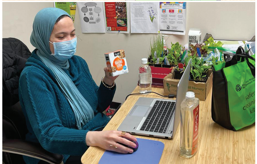
(SHH Promoters - Mother Africa)