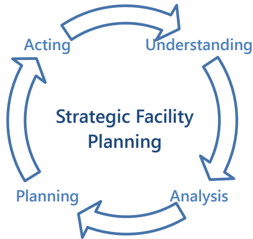
Figure 1. SFP Process