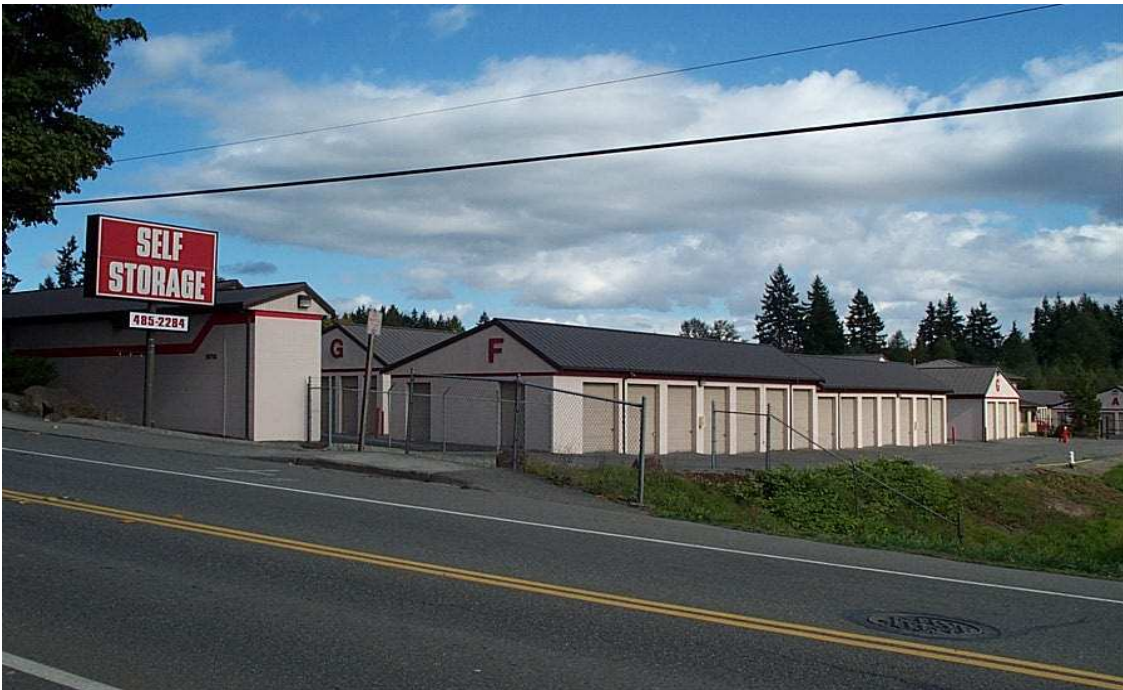
TYPICAL OLDER FACILITY – 18716 68 TH AVE NE, KENMORE