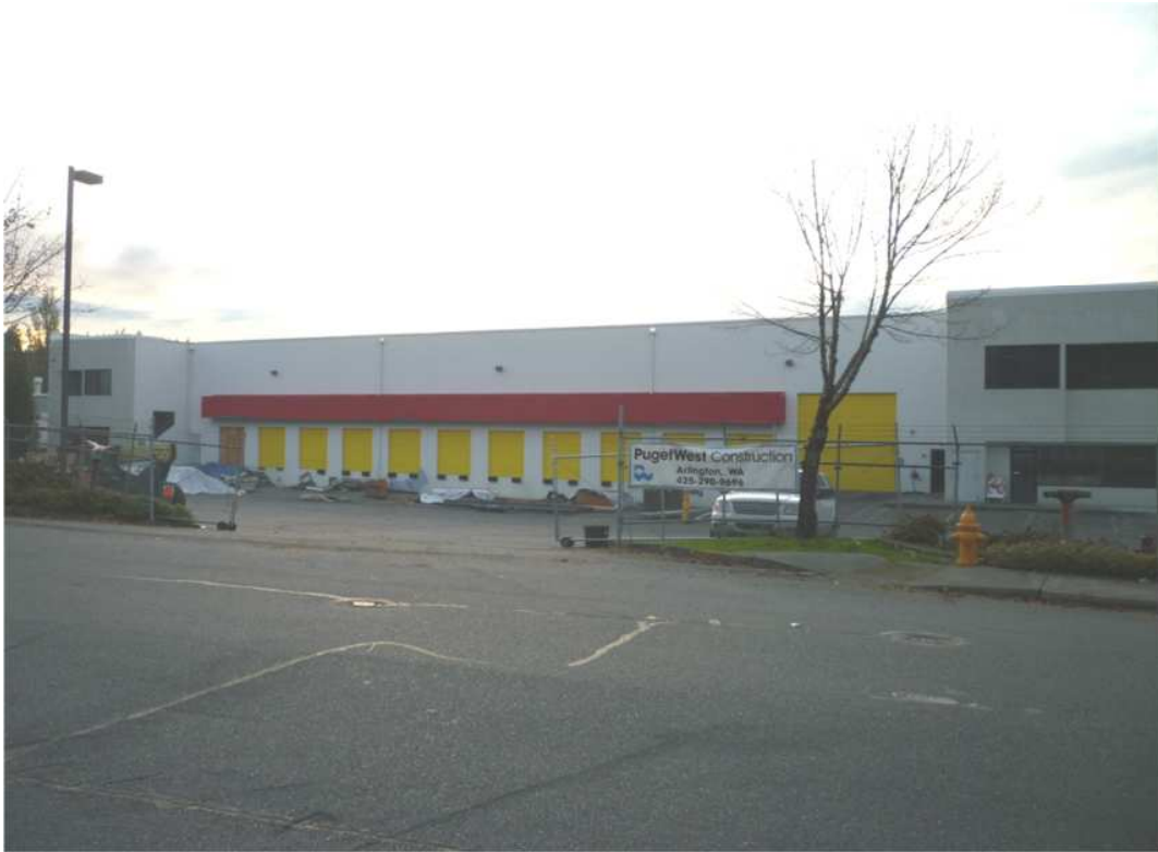
SUBURBAN WAREHOUSE CONVERSION – 7115 132 ND PL. SE, NEWCASTLE