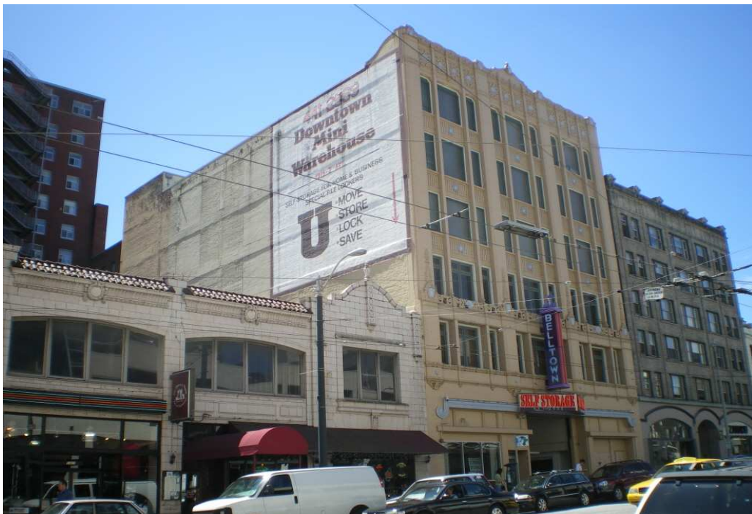
URBAN WAREHOUSE CONVERSION – 1915 3 RD AVE, SEATTLE