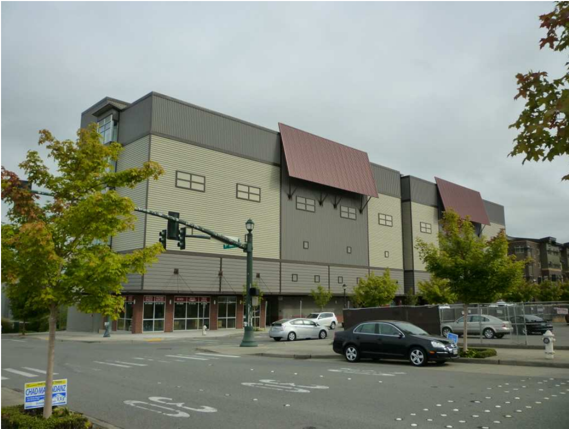
NEW, STATE-OF-THE-ART FACILITY - 910 NE HIGH STREET, ISSAQUAH