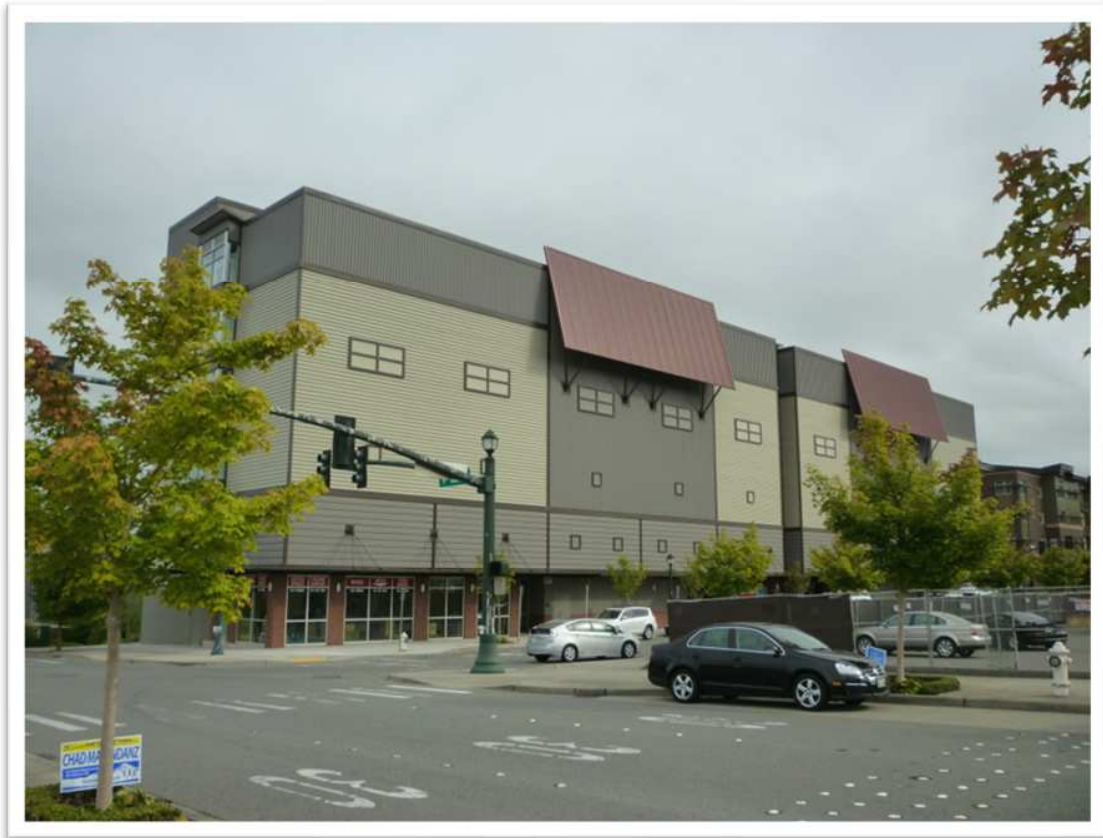
ISSAQUAH HIGHLANDS SELF-STORAGE