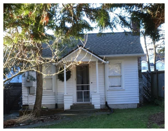
Grade 5/ Year Built 1924/ Total Living Area 730 sf