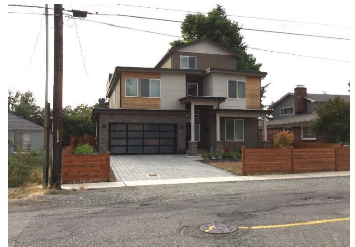
Grade 9/ Year Built 2016/ Total Living Area 2,920 sf