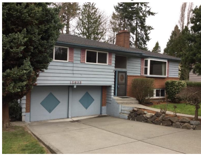
Grade 7/ Year Built 1958/ Total Living Area 1,840 sf