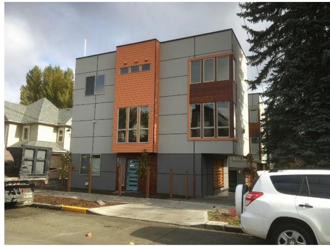
Grade 8/ Year Built 2016/ Total Living Area 1,920 sf