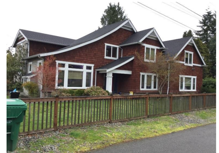
Grade 10/ Year Built 2001/ Total Living Area 3,770 sf