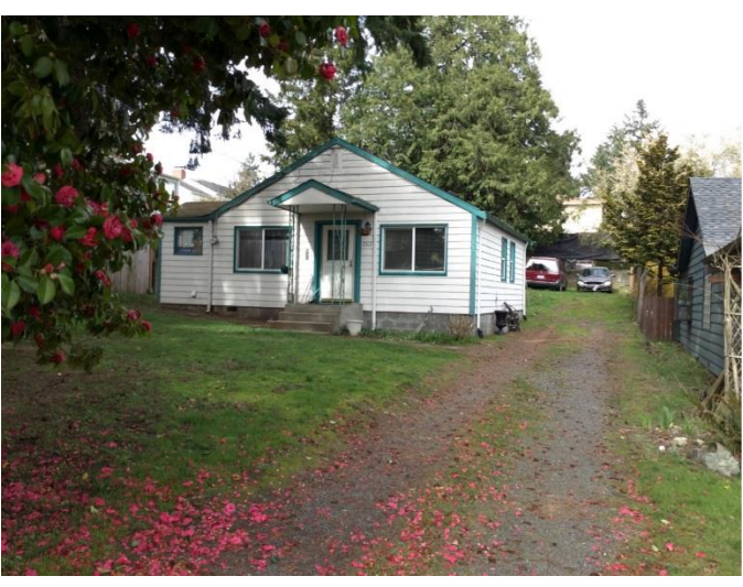
Grade 6/ Year Built 1947/ Total Living Area 620 sf