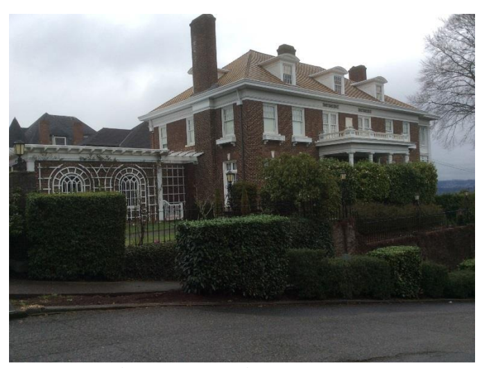
Grade 12/ Year Built 1912/Total Living Area 6370 SF