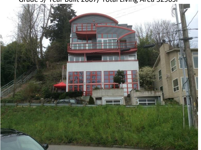
Grade 11/ Year Built 2009/Total Living Area 5330 SF