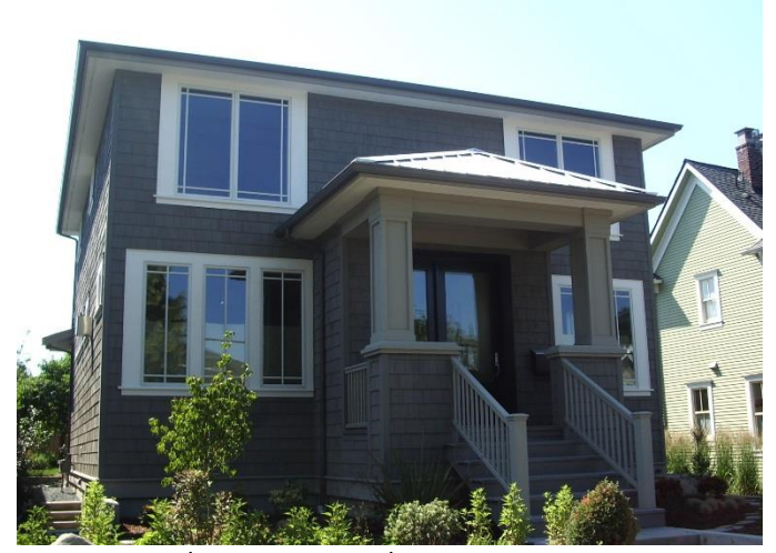
Grade 9/ Year Built 2007/ Total Living Area 3290SF