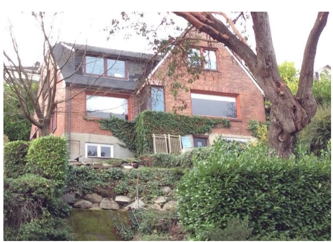
Grade 8/ Year Built 1929/Total Living Area 1720SF