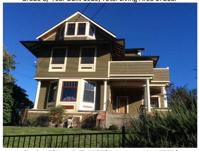
Grade 10/ Year Built 1905/Year renovation 2005/