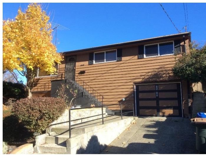
Grade 7/ Year Built 1959/ Total Living Area 1890SF