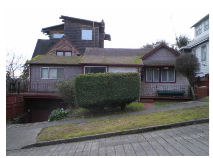
Grade 6/ Year Built 1910/Total Living Area 900 SF