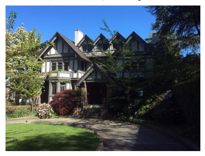
Grade 13/ Year Built 1910/Total Living Area 6400 SF