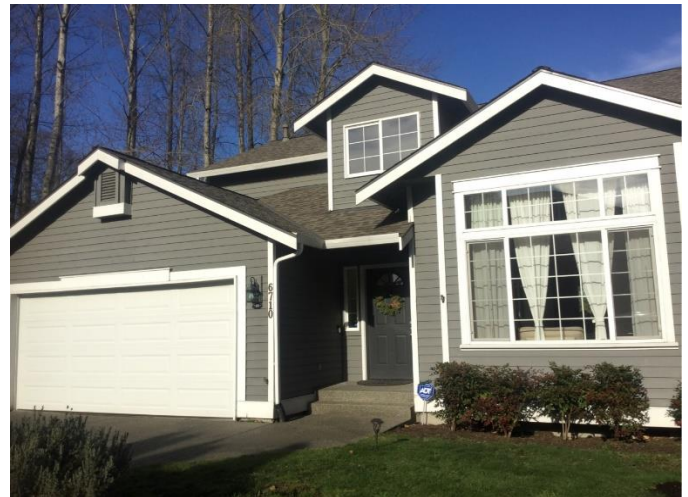
Grade 8/ Year Built 1996/ TLA: 1840 SF