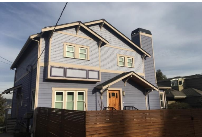
Grade 9/ Year Built 2007/ TLA: 3120 SF