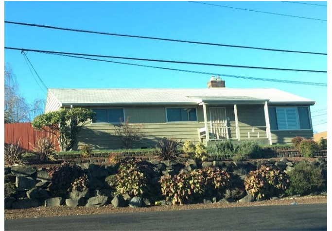
Grade 6/ Year Built 1955/ TLA: 1550 SF