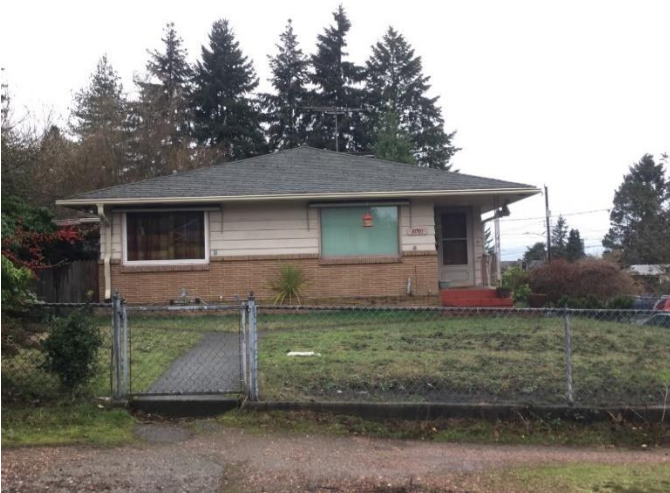
Grade 7/ Year Built 1956/ TLA: 1620 SF