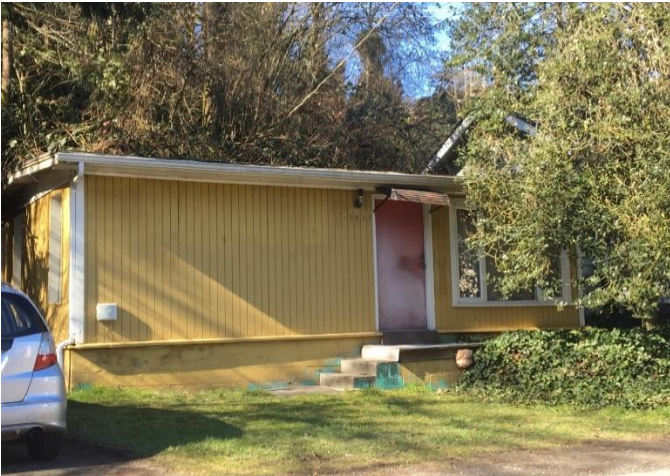
Grade 5/ Year Built 1950/ TLA: 460 SF