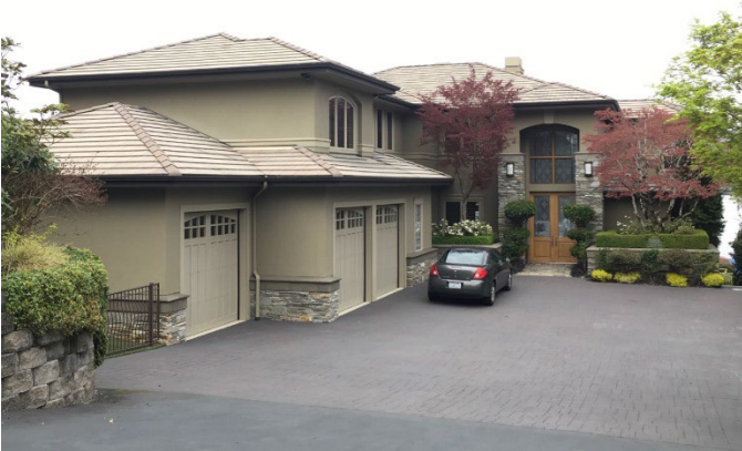
Grade 12/ Year Built 1997 /Total Living Area 8,400