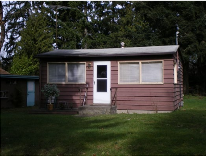
Grade 5/ Year Built 1947 /Total Living Area 530