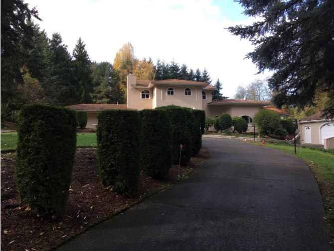
Grade 11/ Year Built 1979 /Total Living Area 6,510