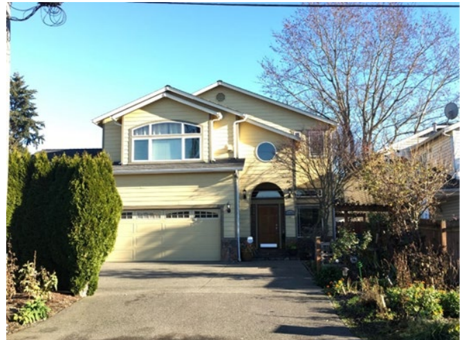
Grade 8/ Year Built 2008/ Total Living Area 3,200