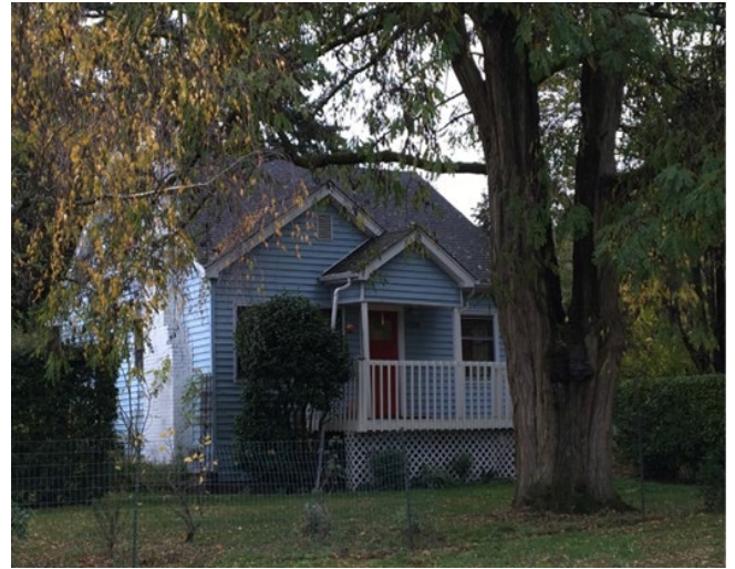
Grade 6/ Year Built 1934/ Total Living Area 1,060