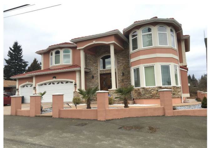
Grade 10/ Year Built 2014 /Total Living Area 4,130