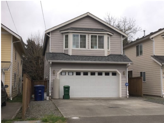
Grade 7/ Year Built 2003/ Total Living Area 1,680