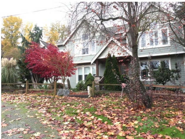
Grade 9/ Year Built 2007 /Total Living Area 5,050