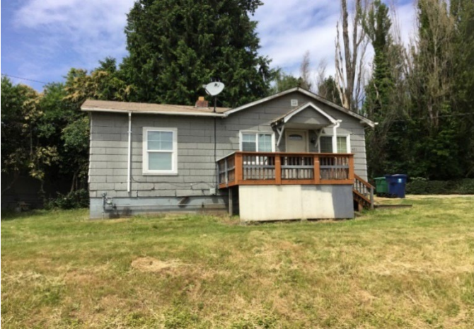
Grade 5/ 1927/ Total Living Area 720