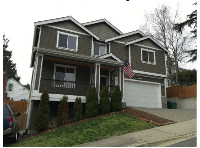
Grade 8/2012/Total Living Area 2400