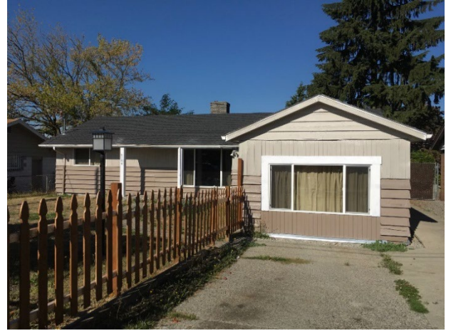
Grade 6/ 1954/ Total Living Area 1420