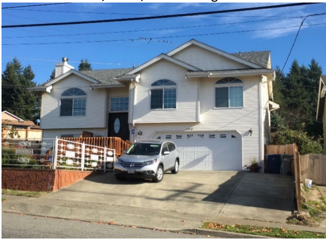
Grade 7/ 1997/ Total Living Area 2090