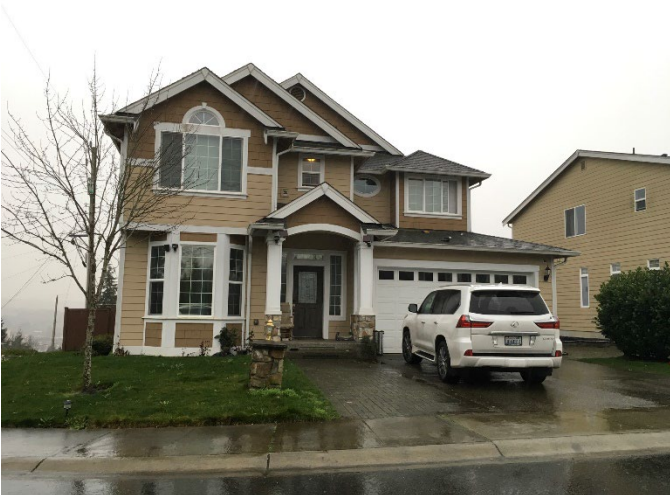
Grade 9/ 2006/ Total Living Area 2870