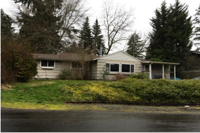
Grade 6 / Year Built 1950 / Total Living Area 1340 SF