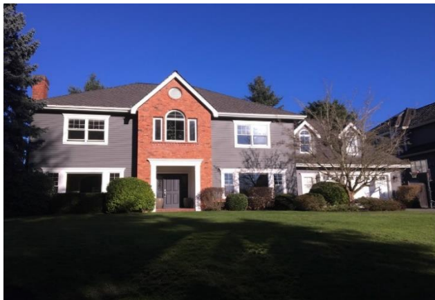
Grade 10 / Year Built 1990 / Total Living Area 3670 SF