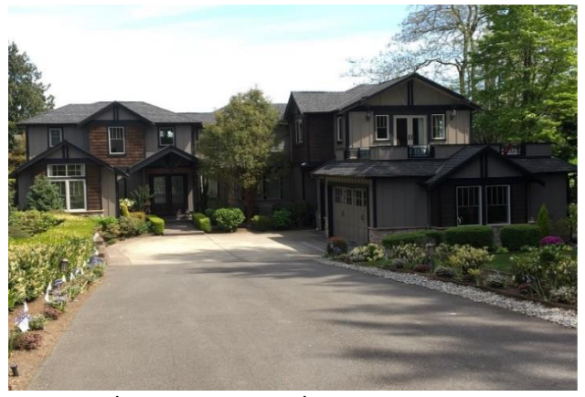
Grade 11 / Year Built 2007 / Total Living Area 4700 SF