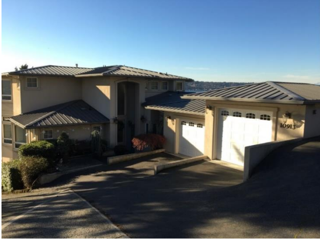
Grade 12 / Year Built 2000 / Total Living Area 5310 SF