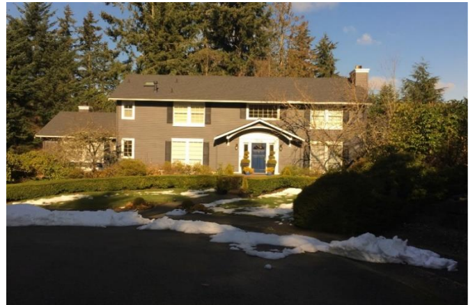
Grade 9 / Year Built 1990 / Total Living Area 3030 SF