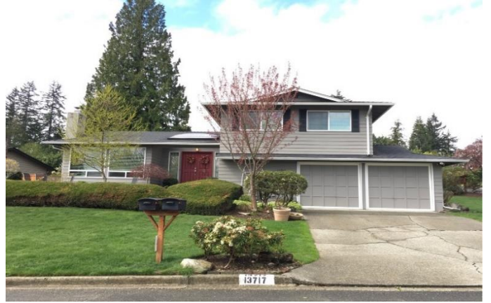
Grade 7 / Year Built 1970 / Total Living Area 1730 SF