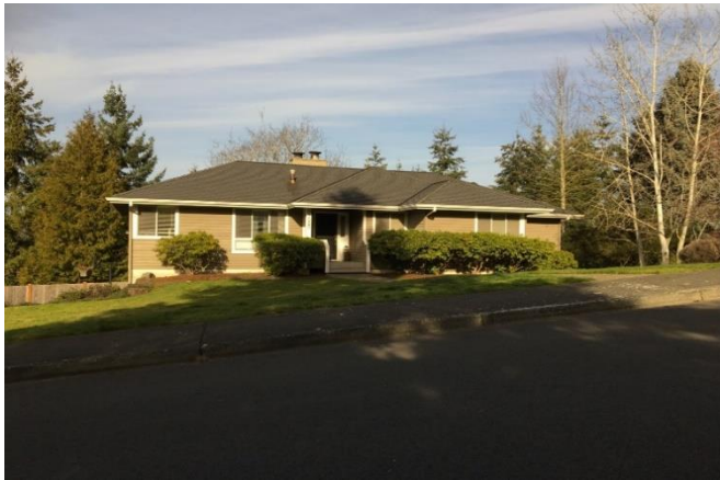
Grade 8 / Year Built 1986 / Total Living Area 2340 SF