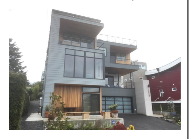
Grade 9/ Year Built 2018/ Total Living Area 3,580