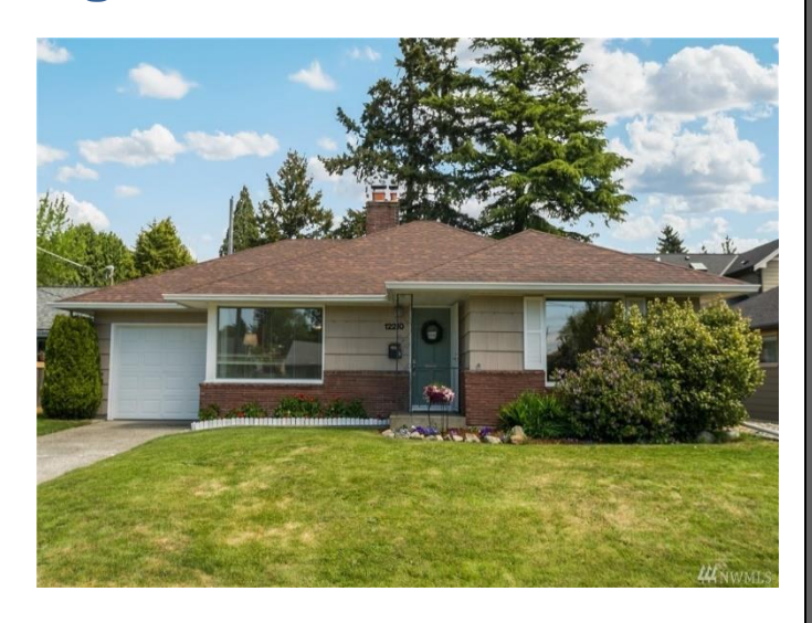
Grade 7/ Year Built 1951/ Total Living Area 1,520