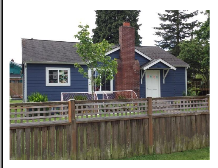
Grade 6/ Year Built 1940/ Total Living Area 940