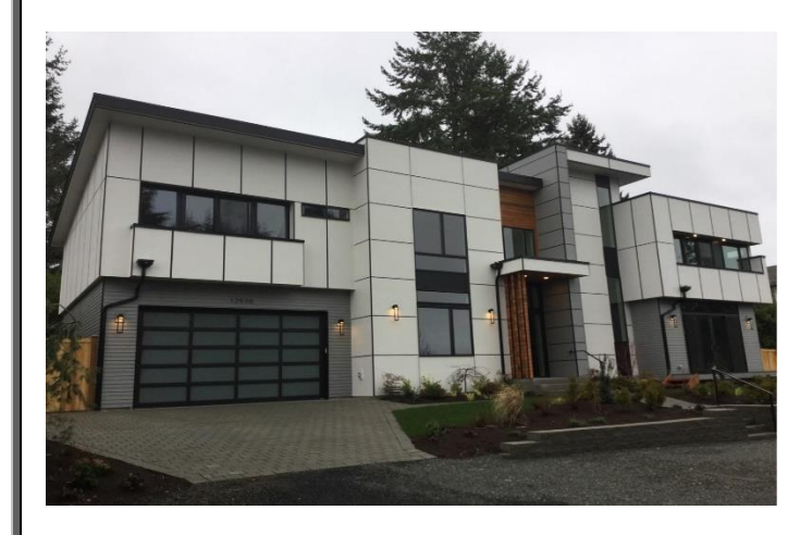
Grade 10/ Year Built 2019/ Total Living Area 3,890