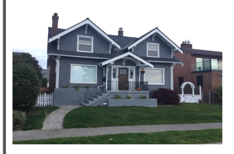
Grade 8/ Year Built 1925/ Total Living Area 2,500