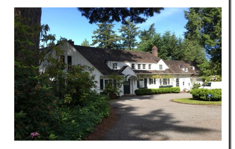
Grade 11/ Year Built 1921/ Total Living Area 4,950