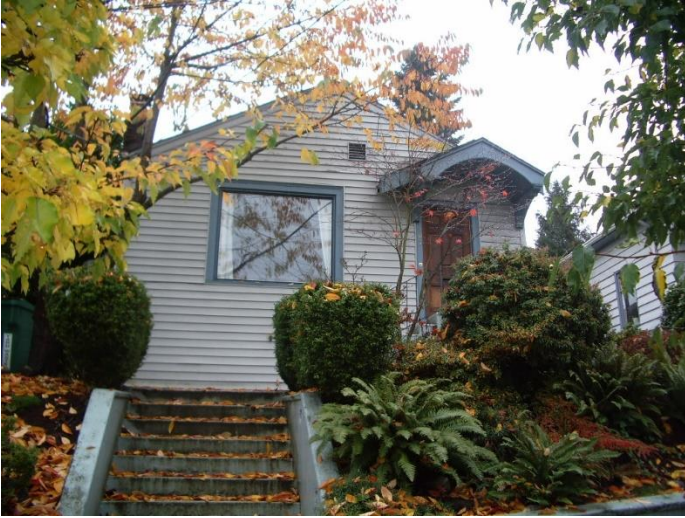
Grade 6/ Year Built 1914/ Total Living Area 920sf