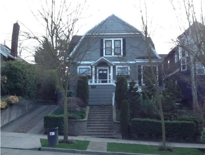
Grade 8/ Year Built 1907/ Total Living Area 3,250sf