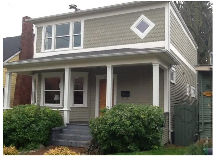
Grade 7/ Year Built 1918/ Total Living Area 2,410sf