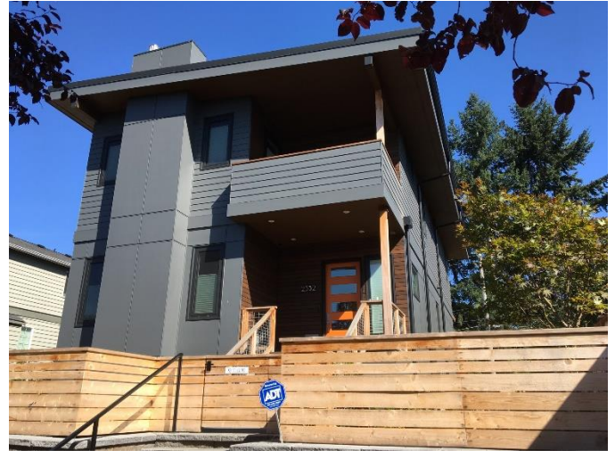
Grade 9/ Year Built 2016/ Total Living Area 3,640sf