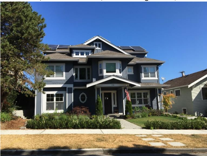
Grade 10/ Year Built 2016/ Total Living Area 4,030sf