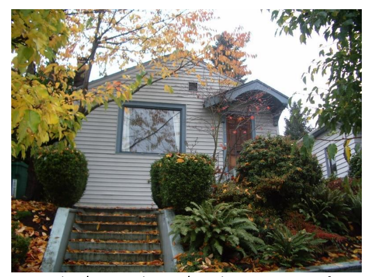
Grade 6/ Year Built 1914/ Total Living Area 920sf