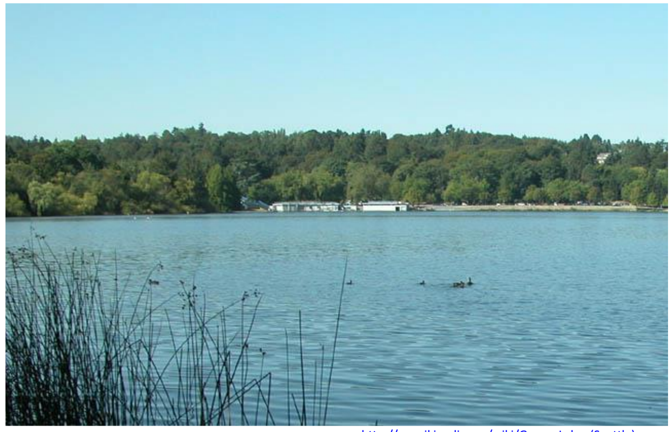
http://en.wikipedia.org/wiki/Green Lake (Seattle)