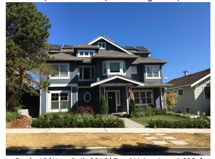
Grade 10/ Year Built 2016/ Total Living Area 4,030sf