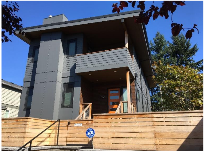
Grade 9/ Year Built 2016/ Total Living Area 3,640sf