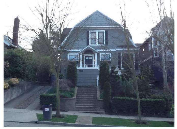
Grade 8/ Year Built 1907/ Total Living Area 3,250sf