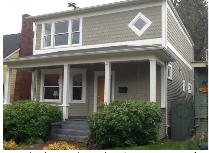
Grade 7/ Year Built 1918/ Total Living Area 2,410sf