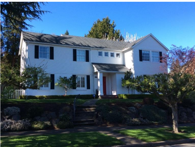
Grade 9/Year Built 1940/Total Living Area 3010 SF