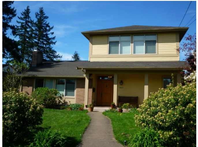
Grade 8/Year Built 1950/Total Living Area 2700 SF