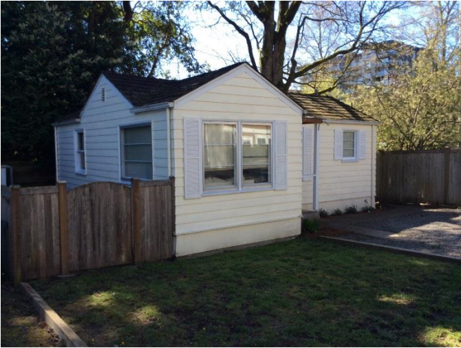
Grade 5/Year Built 1940/Total Living Area 580 SF