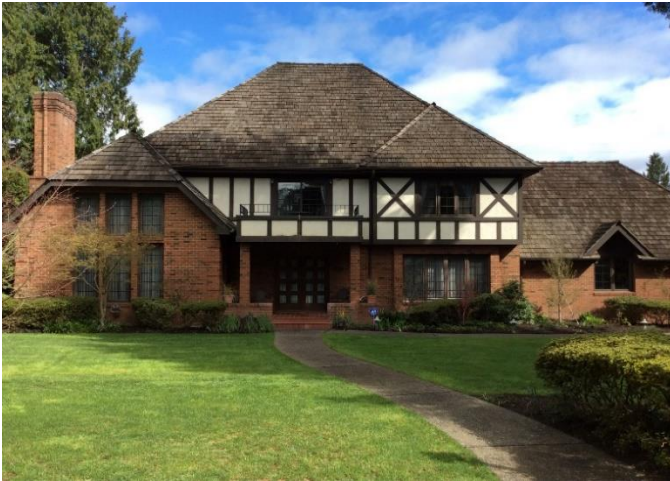
Grade 11/Year Built 1983/Total Living Area 4680 SF