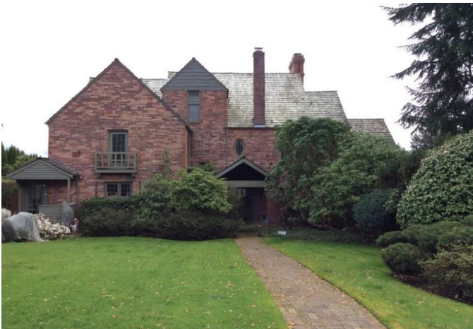
Grade 12/ Year Built 1931/ Total Living Area 5140 SF