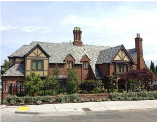
Grade 13/Year Built 1928/Total Living Area 6830 SF