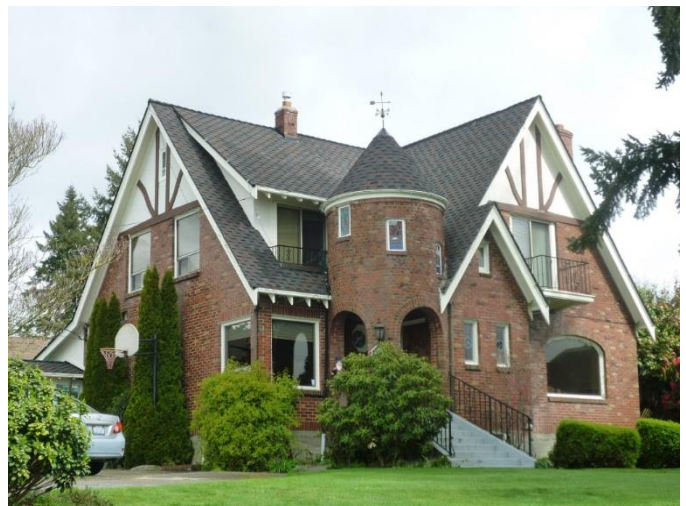
Grade 10/Year Built 1939/Total Living Area 3240 SF