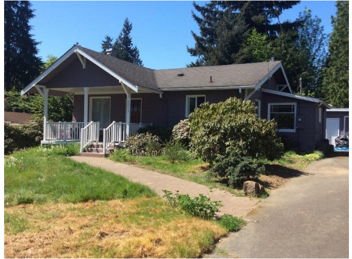
Grade 6/Year Built 1917/Total Living Area 1420 SF