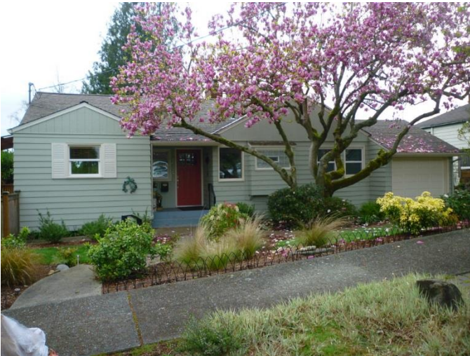
Grade 7/Year Built 1943/Total Living Area 1760 SF