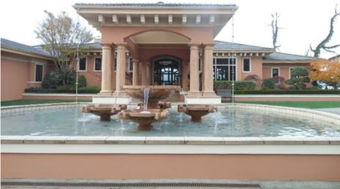
Grade 13/ Year Built 2001/ Total Living Area 6410