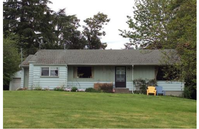
Grade 6/ Year Built 1942/ Total Living Area 1070