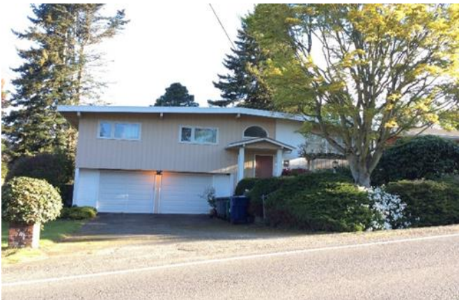
Grade 7/ Year Built 1958/ Total Living Area 1480