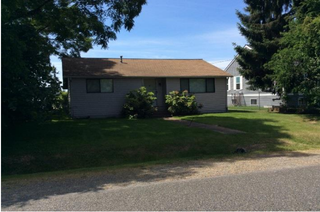
Grade 5/ Year Built 1941/ Total Living Area 730