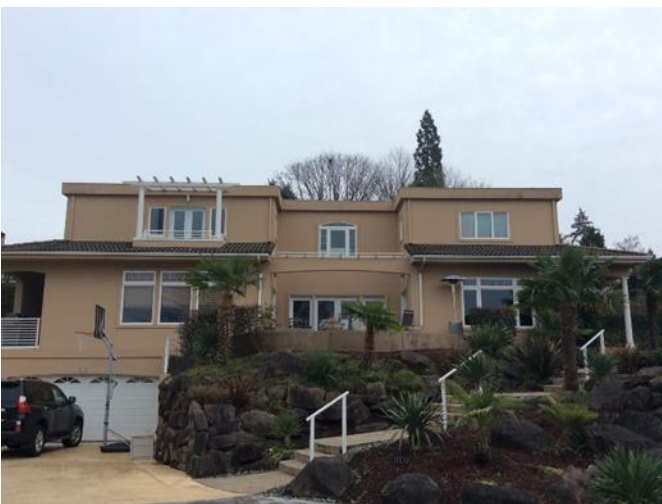
Grade 9/ Year Built 1997/ Total Living Area 2910