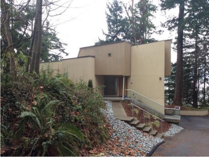
Grade 11/ Year Built 2008/ Total Living Area 3226