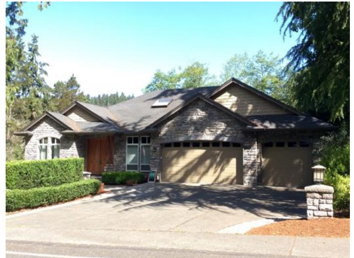
Grade 10/ Year Built 2005/ Total Living Area 3764