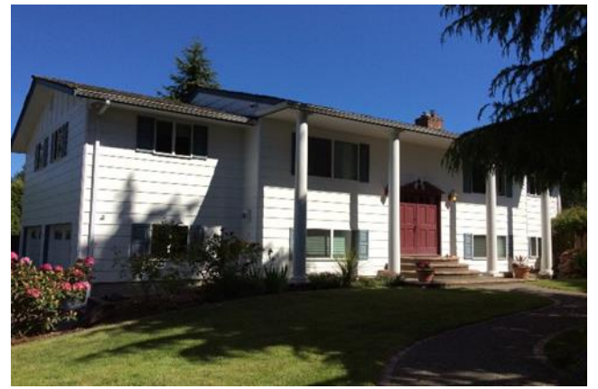
Grade 8/ Year Built 1970/ Total Living Area 2540