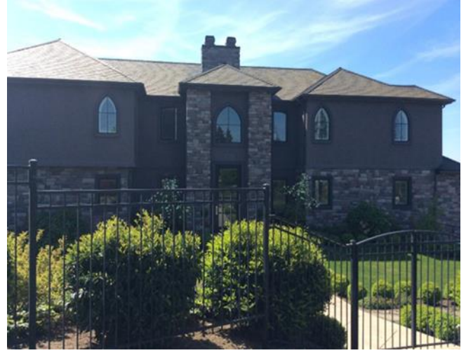
Grade 12/Year Built 2010/Total Living Area 4800