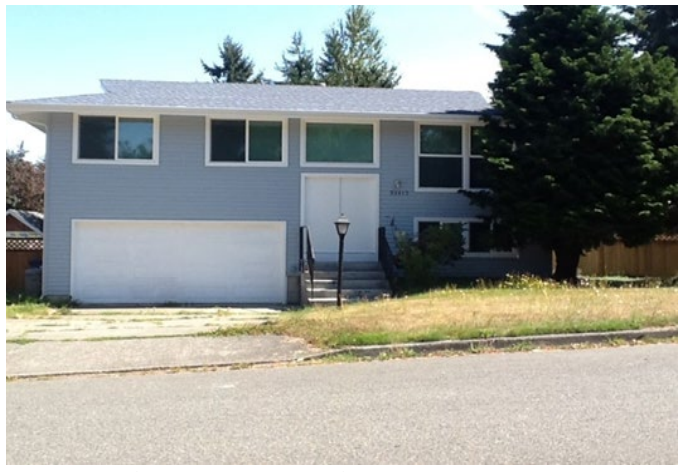
Grade 7/ Year Built: 1975/ Total Living Area: 1,620sf