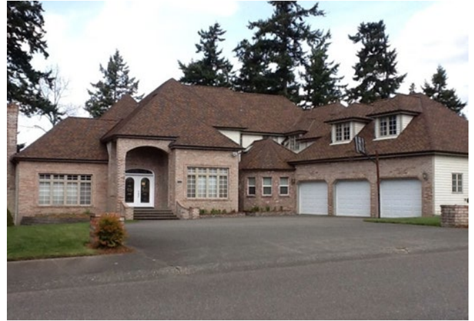
Grade 11/ Year Built: 1991/ Total Living Area: 4,620sf