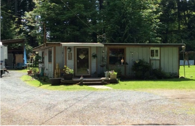
Grade 4/ Year Built: 1964/ Total Living Area: 930sf