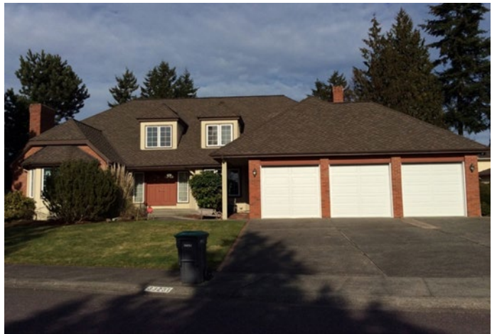
Grade 9/ Year Built: 1986/ Total Living Area 2,860sf