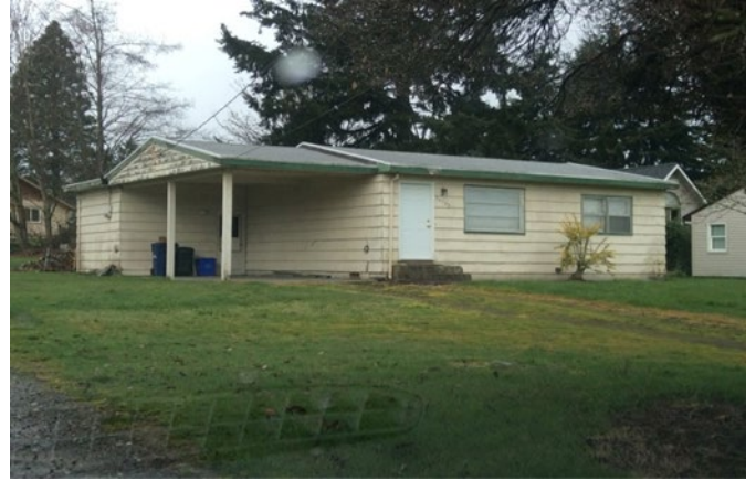
Grade 5/ Year Built: 1955/ Total Living Area: 910sf