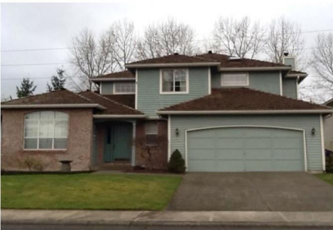
Grade 8/ Year Built: 1991/ Total Living Area: 2,030sf