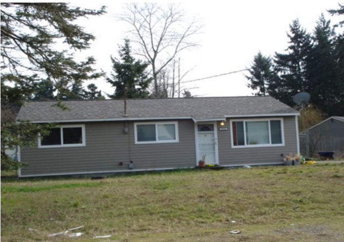
Grade 6/ Year Built: 1958/ Total Living Area: 800sf