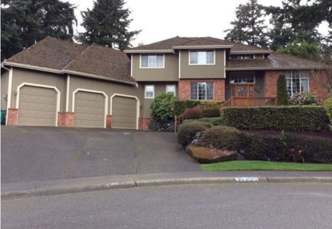
Grade 10/ Year Built: 1989/ Total Living Area: 2,500sf