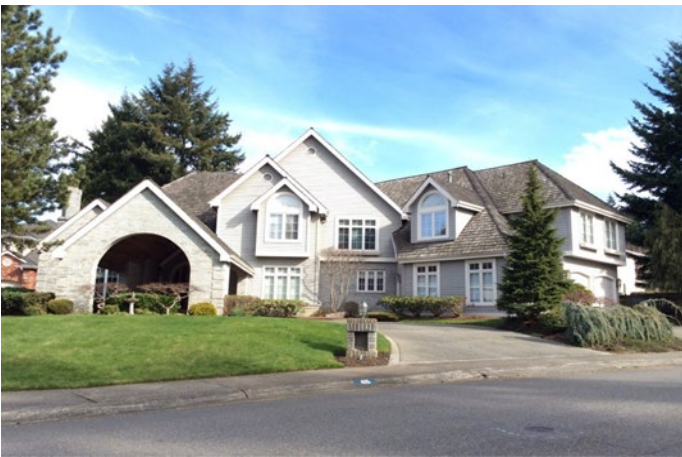
Grade 12/ Year Built: 1988/ Total Living Area: 4,960sf