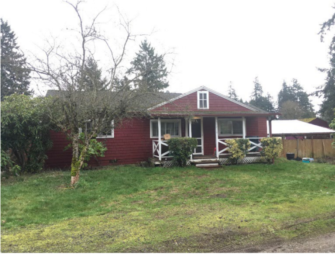
Grade 4/ Year Built 1948/ Total Living Area 830 sf