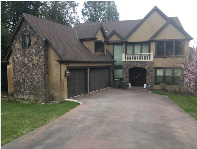
Grade 12/ Year Built 2007/ Total Living Area 7,783 sf