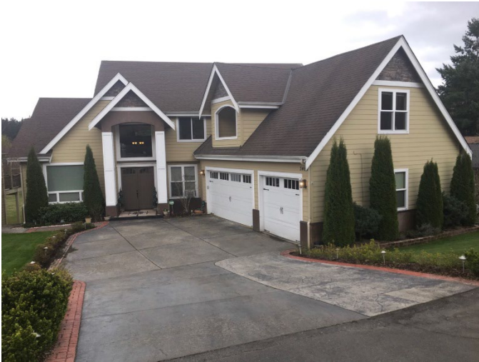
Grade 10/ Year Built 2007/ Total Living Area 3,560 sf