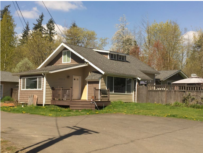
Grade 6/ Year Built 1939/ Total Living Area 2,570 sf