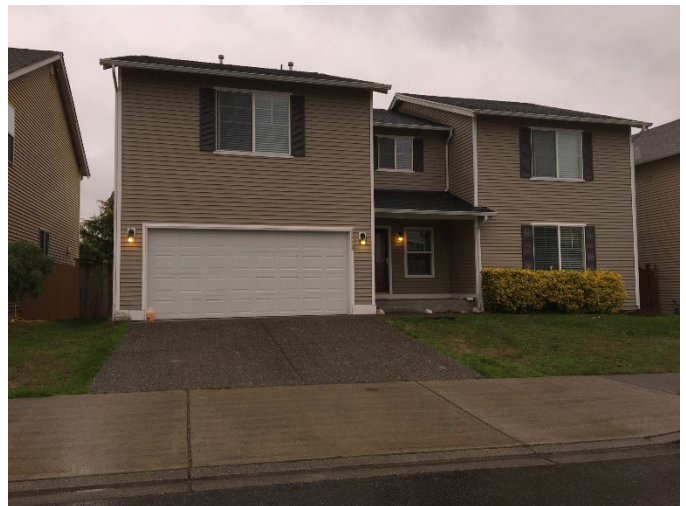
Grade 7/ Year Built 2004/ Total Living Area 3,320 sf