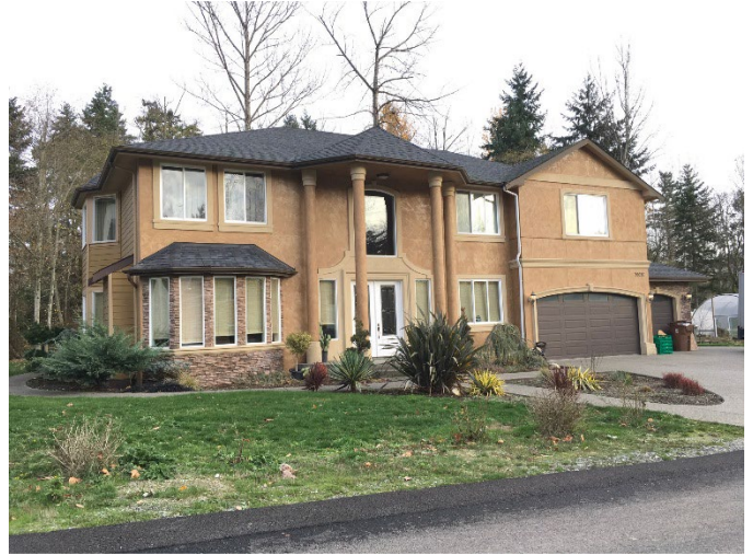
Grade 11/ Year Built 2007/ Total Living Area 4,230 sf