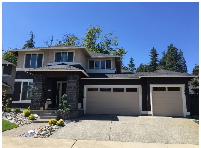
Grade 9/ Year Built 2014/ Total Living Area 3,221 sf