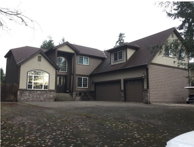
Grade 8/ Year Built 1994/ Total Living Area 3,740 sf