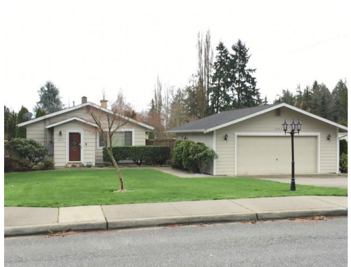
Grade 5/ Year Built 1963/ Total Living Area 1,110 sf