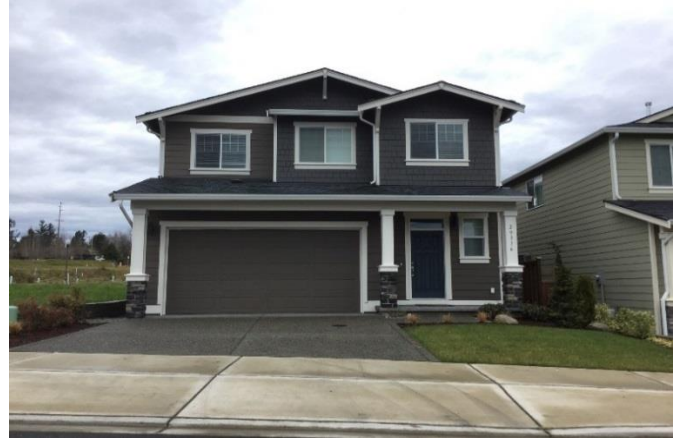
Grade 8 / Year Built 2015 / Total Living Area 2602 Sq Ft