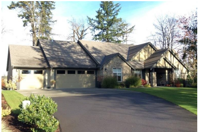
Grade 10 / Year Built 2013 / Total Living Area 2540 Sq Ft