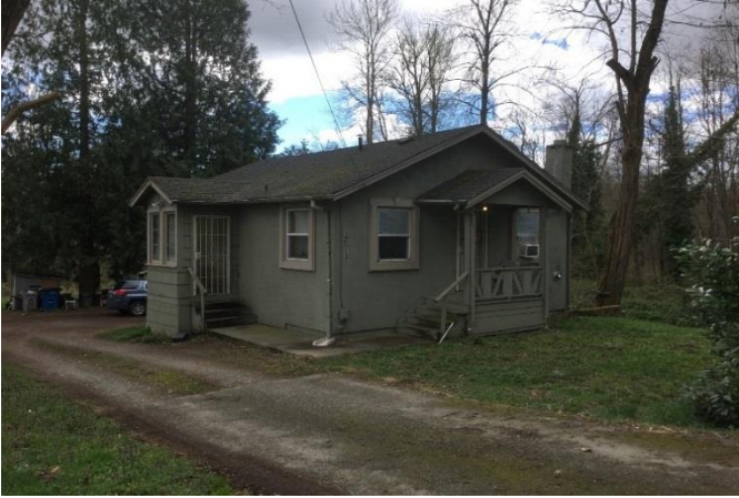
Grade 5 / Year Built 1938 / Total Living Area 1608 Sq Ft