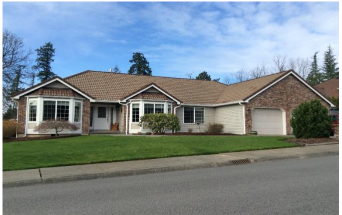
Grade 9 / Year Built 1988 / Total Living Area 2320 Sq Ft