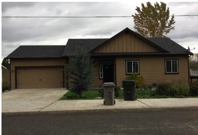
Grade 7 / Year Built 2011 / Total Living Area 2380 Sq Ft