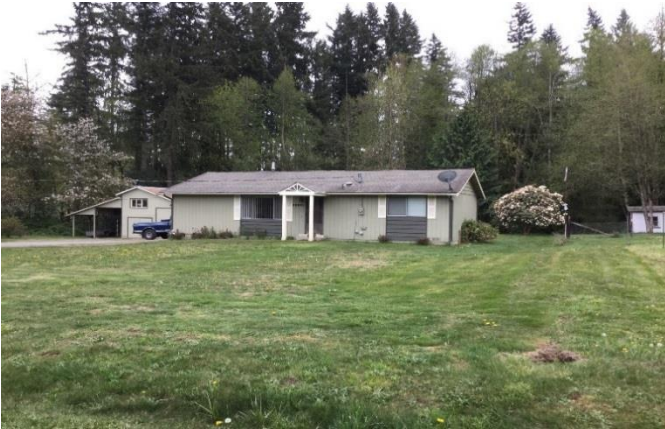
Grade 6 / Year Built 1978 / Total Living Area 1250 Sq Ft