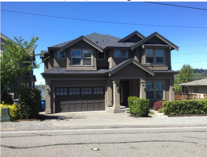
Grade 10/2013/Total Living Area 4,480