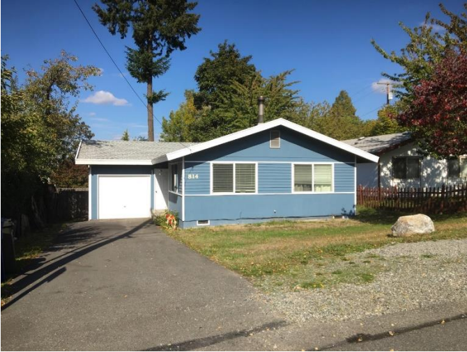
Grade 6/1971/Total Living Area 960