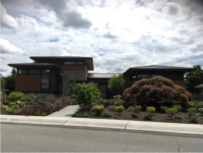
Grade 12/2017/Total Living Area 4,290