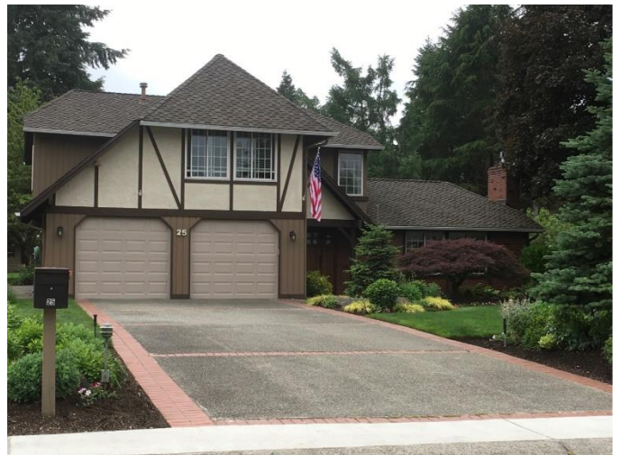
Grade 9/1975/Total Living Area 2,520