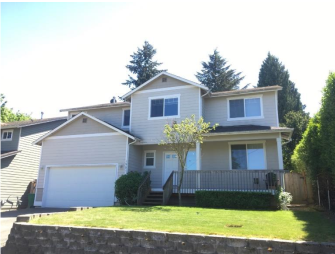
Grade 8/2007/Total Living Area 2,650