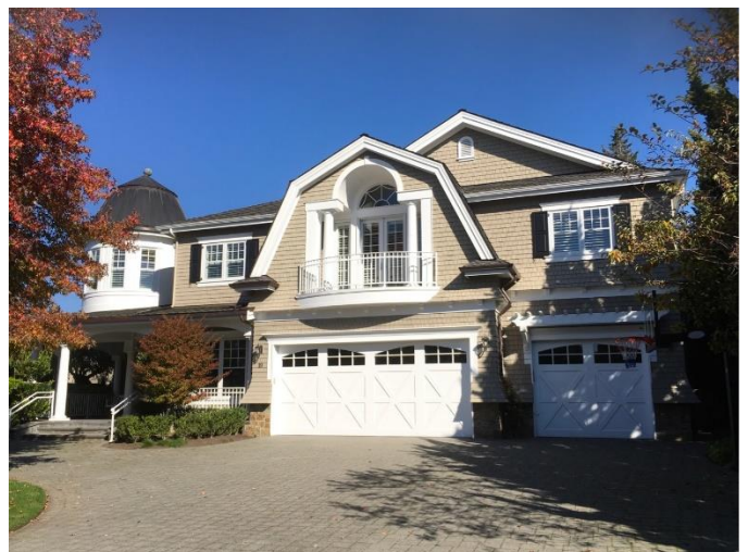
Grade 11/2008/Total Living Area 5,230