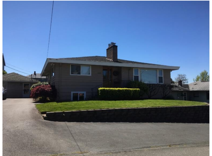
Grade 7/1960/Total Living Area 2,520