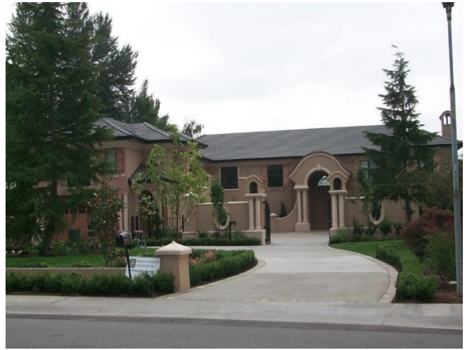
Grade 13/2001/Total Living Area 7,780