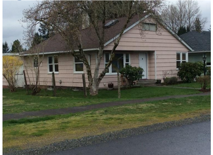
Grade 6/ Year Built 1951/ Total Living Area 1,290