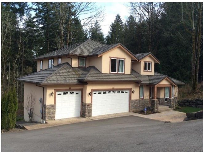
Grade 9/Year Built 2008/ Total Living Area 3,690