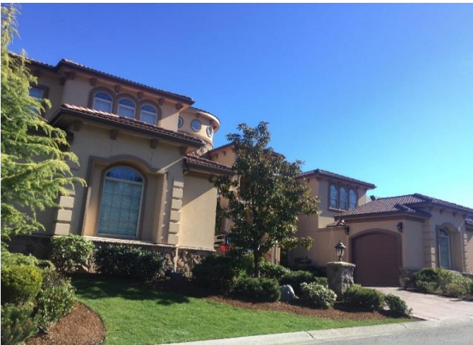
Grade 13/Year Built 2008/ Total Living Area 8,090