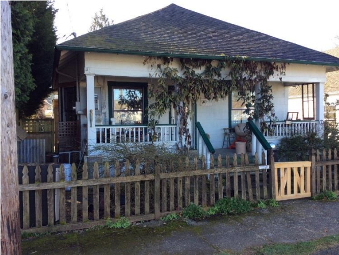
Grade 5/ Year Built 1900/ Total Living Area 1,040