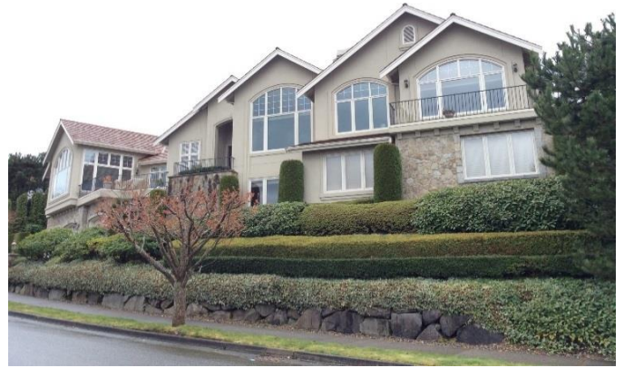
Grade 12/Year Built 2000/ Total Living Area 5,370