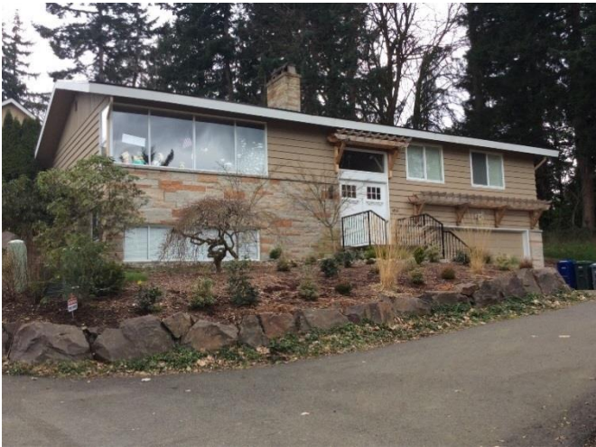
Grade 7/ Year Built 1960/ Total Living Area 2,000