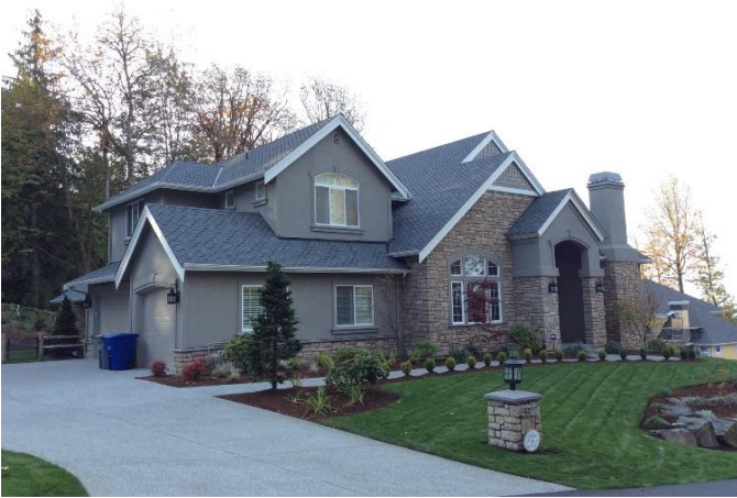
Grade 11/Year Built 2015/ Total Living Area 5,640