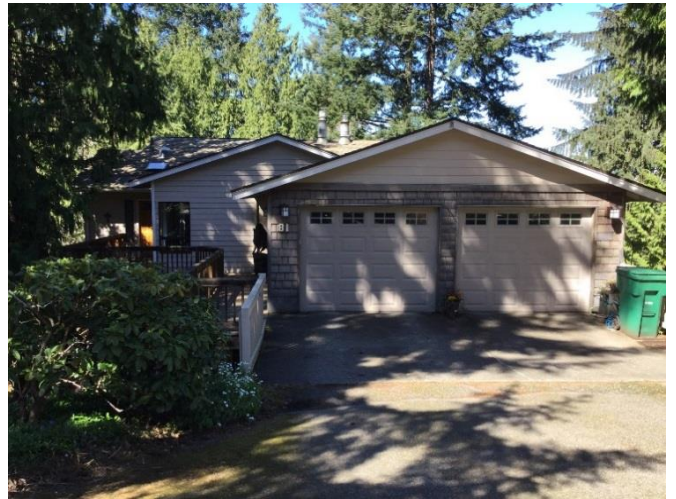
Grade 8/ Year Built 1978/ Total Living Area 2,300