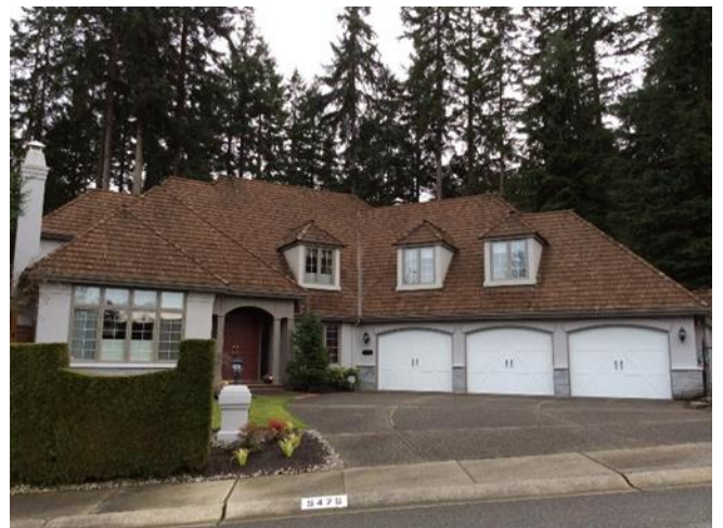
Grade 10/Year Built 1995/ Total Living Area 3,690