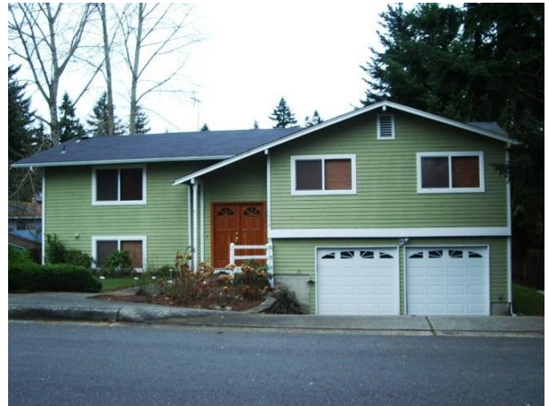
Grade 7/ Year Built 1976/ Total Living Area 2050