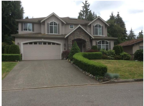
Grade 9/ Year Built 2003/ Total Living Area 2800