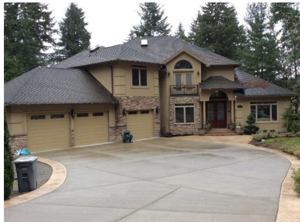
Grade 11/ Year Built 2006/ Total Living Area 4360