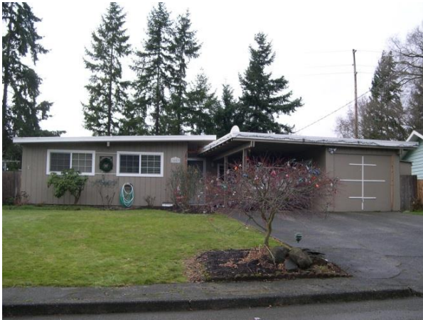
Grade 6/ Year Built 1959/ Total Living Area 990