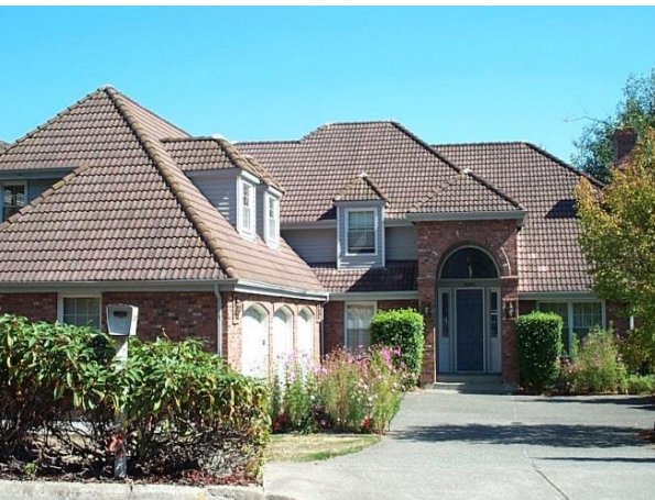
Grade 10/ Year Built 1987/ Total Living Area 3500