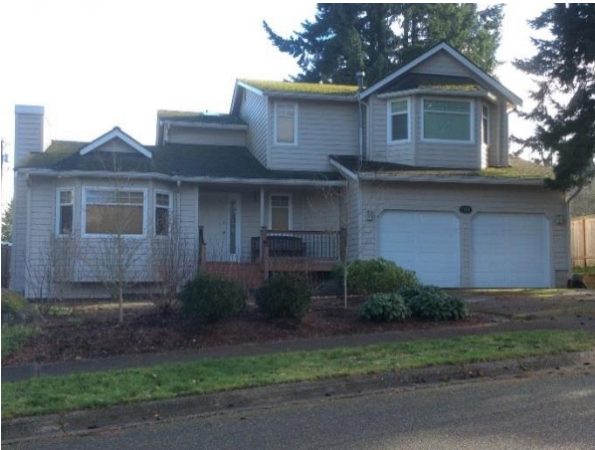
Grade 8/ Year Built 1983/ Total Living Area 2040