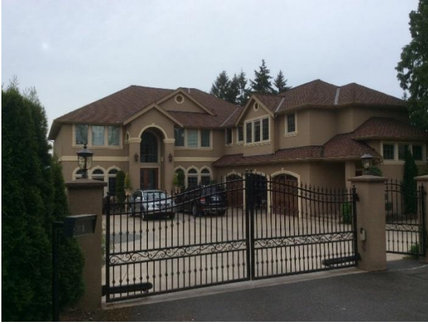
Grade 12/ Year Built 2007/ Total Living Area 6260