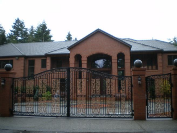
Grade 13/ Year Built 2001/ Total Living Area 13,610