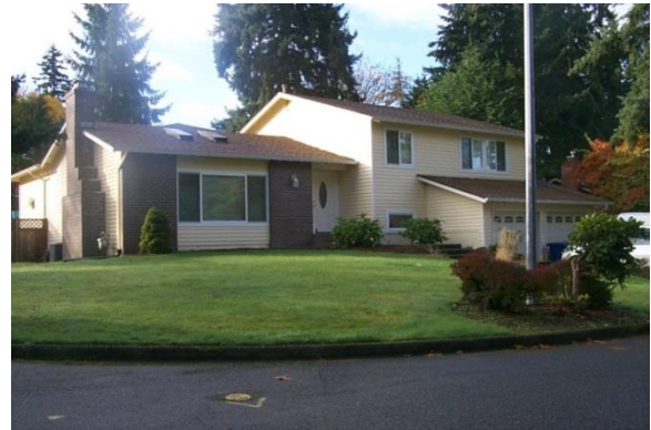
Grade 8/ Year Built 1972/ Total Living Area 2,580