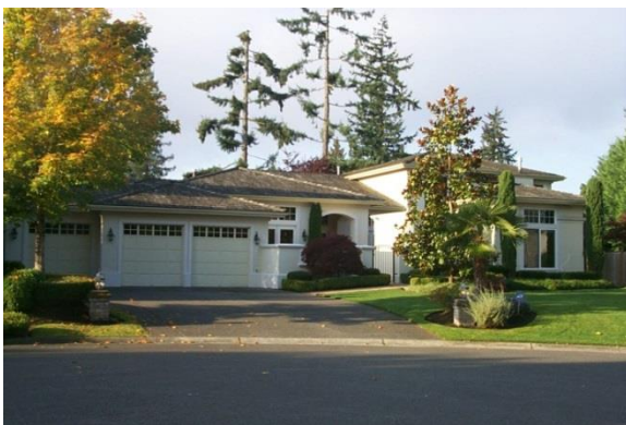
Grade 11/ Year Built 1999/ Total Living Area 5,070