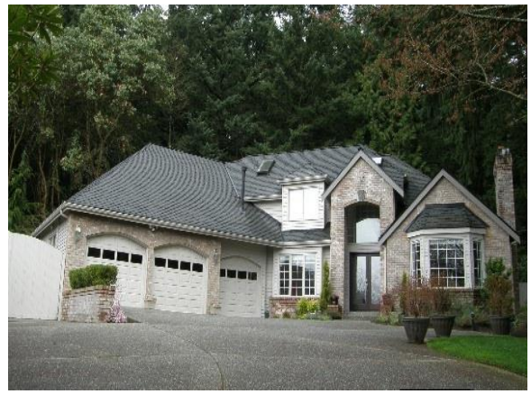
Grade 10/ Year Built 1992/ Total Living Area 3,360