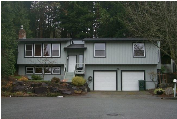
Grade 7/ Year Built 1975/ Total Living Area 1,680