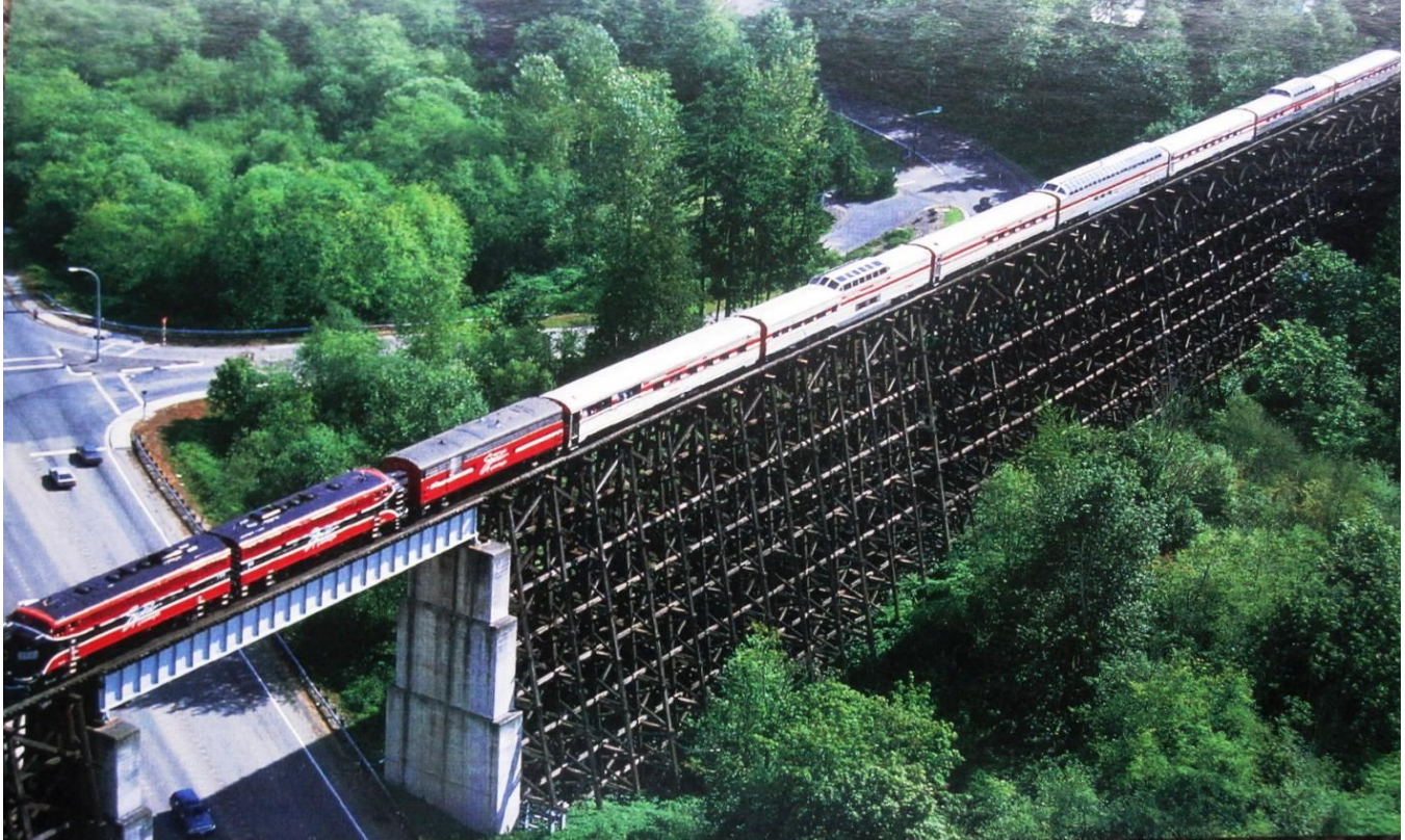
The Spirit of Washington dinner train on the Wilburton Trestle, date unknown.