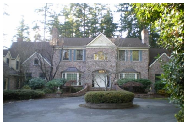
Grade 12/ Year Built 1989/ Total Living Area 8,300