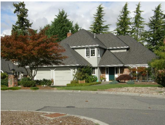
Grade 9/ Year Built 1984/ Total Living Area 2,420