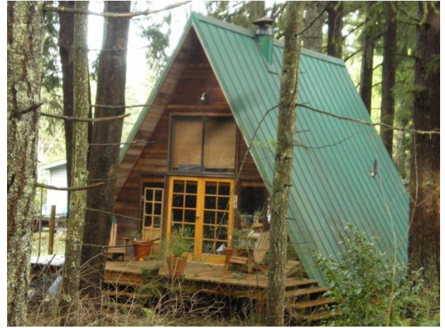
Grade 4/ Year Built 1966/ Total Living Area 530sf