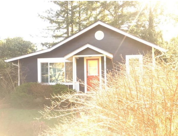
Grade 5/ Year Built 1925/ Total Living Area 750sf