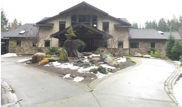
Grade 11/ Year Built 2008/ Total Living Area 6,510sf