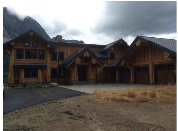
Grade 12/ Year Built 2013/ Total Living Area 5,550sf