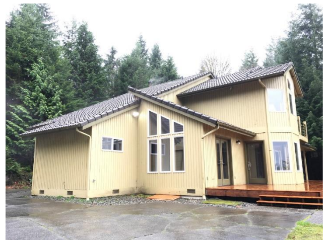
Grade 8/ Year Built 1991/ Total Living Area 2,470sf