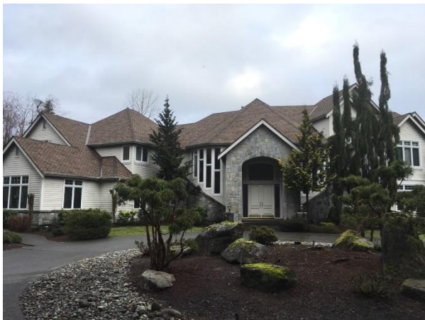
Grade 13/ Year Built 2001/ Total Living Area 10,470sf

Area Error! Reference source not found. Area Information