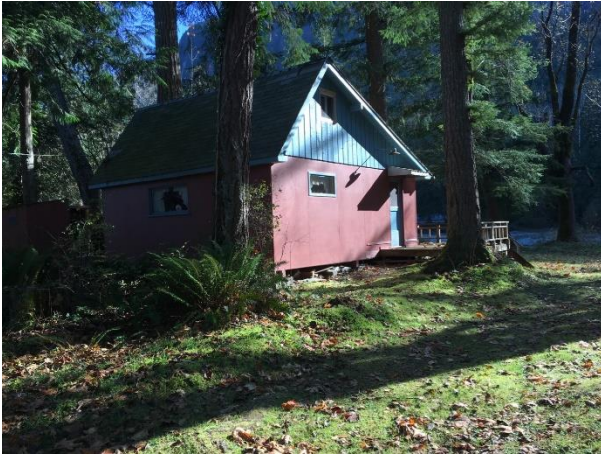
Grade 3/ Year Built 1961/ Total Living Area 440sf