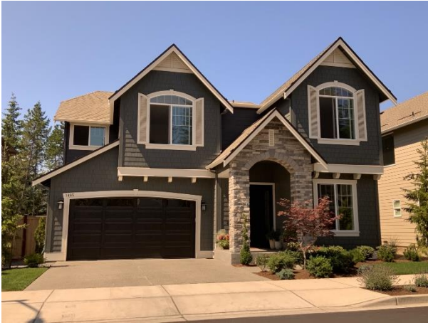
Grade 9/ Year Built 2020/ Total Living Area 3,500sf