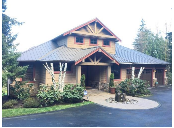
Grade 10/ Year Built 2003/ Total Living Area 3,970sf