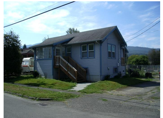
Grade 6/ Year Built 1922 renovated 1990/ Total Living Area 970sf