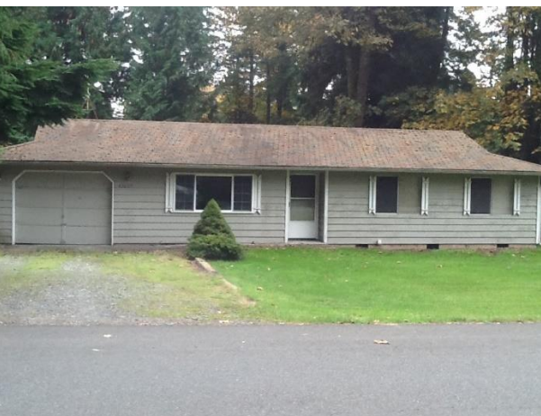
Grade 7/ Year Built 1986/ Total Living Area 1,140sf