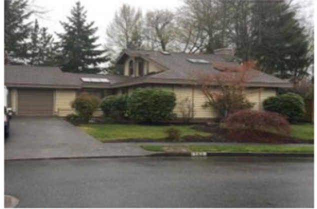
Grade 8/ Year Built 1969/ Total Living Area 2100