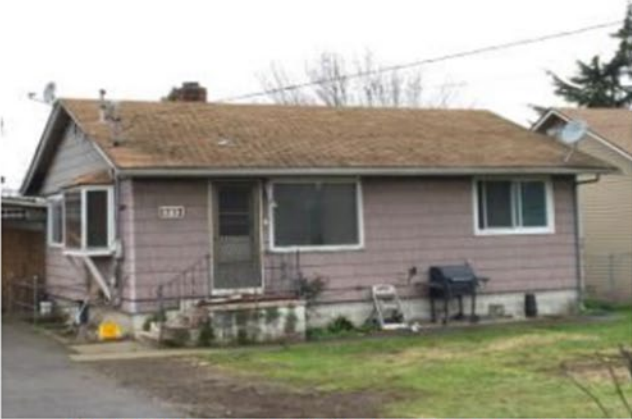
Grade 5/ Year Built 1943/ Total Living Area 720