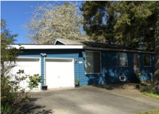
Grade 6/ Year Built 1947/ Total Living Area 1090