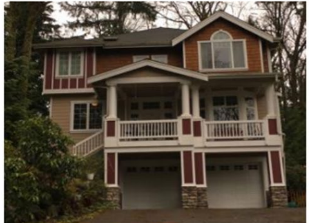
Grade 9 /Year Built 2006/ Total Living Area 3020