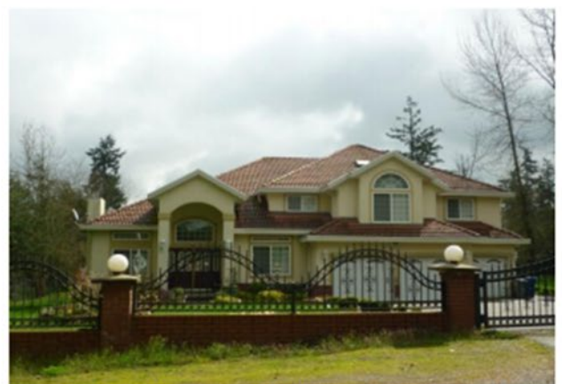
Grade 10/ Year Built 2001/Total Living Area 3570