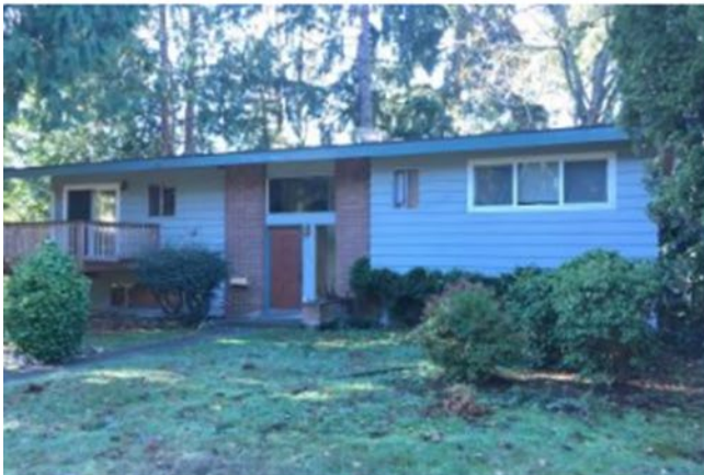
Grade 7/ Year Built 1964/ Total Living Area 1860