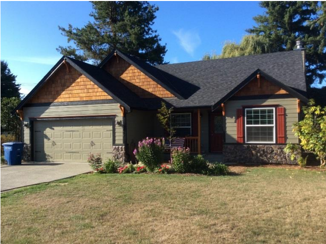
Grade 7/ Year Built 2014/ Total Living Area 1,400 sq. ft.