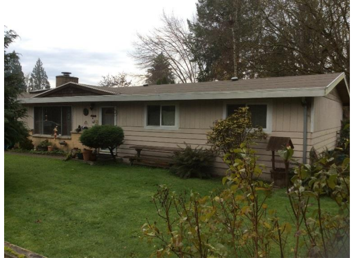
Grade 6/ Year Built 1964/ Total Living Area 1,220 sq. ft.