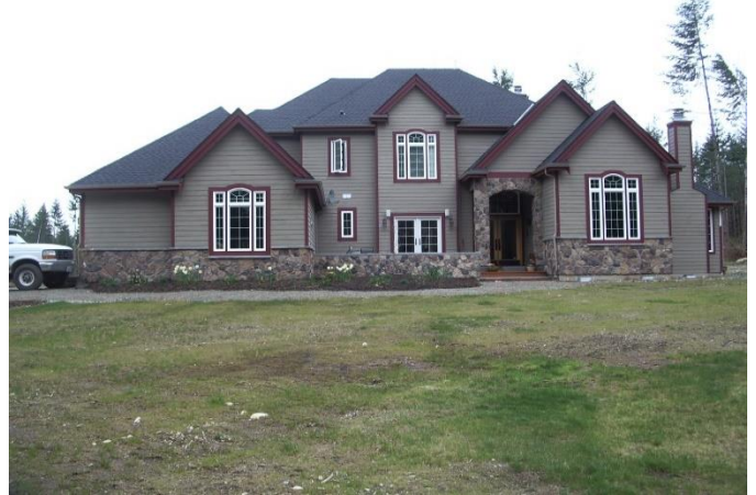
Grade 10/ Year Built 2006/ Total Living Area 3,610 sq. ft.