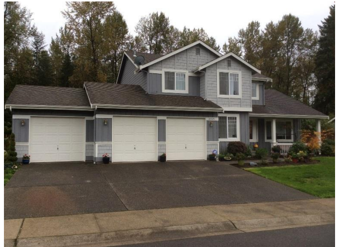
Grade 8/ Year Built 1999/ Total Living Area 2,280 sq. ft.