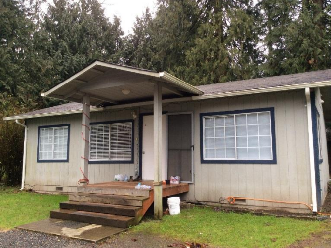
Grade 5/ Year Built 1925/ Total Living Area 900 sq. ft.