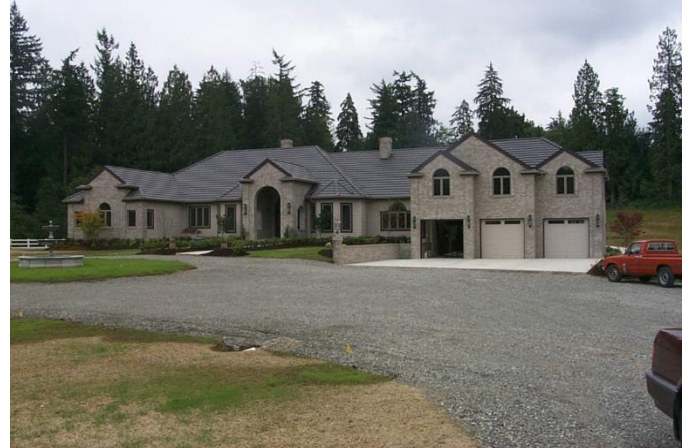
Grade 12/ Year Built 1999/ Total Living Area 5,350 sq. ft.