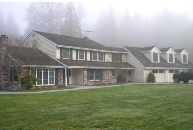
Grade 9/ Year Built 1981/ Total Living Area 3,440 sq. ft.