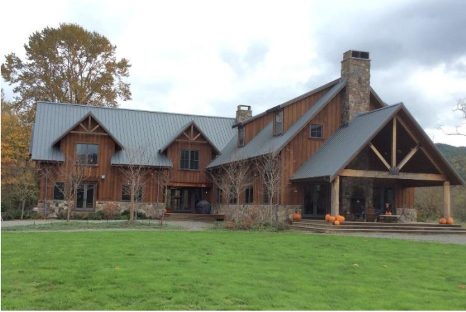
Grade 11/ Year Built 2008/ Total Living Area 5,220 sq. ft.