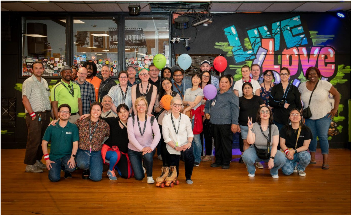
Photo of County staff and Equity Work Group members from June 2023 Open House at Southgate Roller Rink in White Center

The 2024 Update was an opportunity for King County to start a new conversation with members of historically underrepresented communities about how to best work together to plan for the future. The process improvements that were implemented helped to make public engagement on Plan development more collaborative, accessible, and equitable, resulting in more than 1,500,000 points of public engagement and over 10,000 comments received. There is still more work to be done to evaluate, identify, and implement the lessons learned from the 2024 Update and to continue to evolve the engagement process. However, these new diversified engagement strategies, community partnerships, and insights from the Equity Work Group lay a solid foundation for more equitable engagement in future Plan updates.