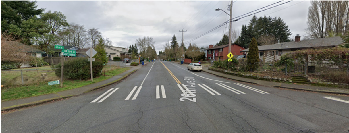
26th Ave and SW 104 th St