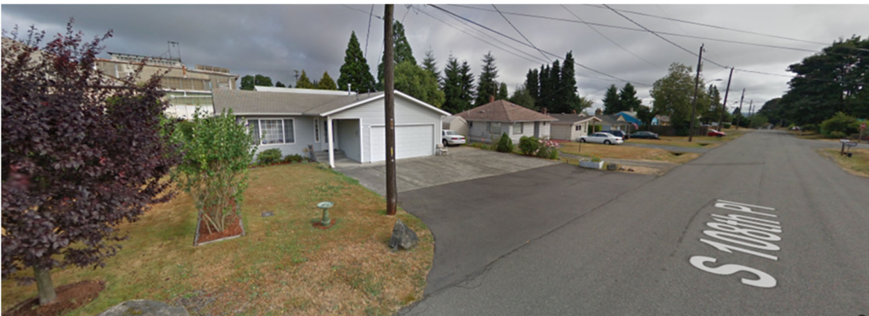
S 108 th Pl and 2 nd Ave S, near Top Hat