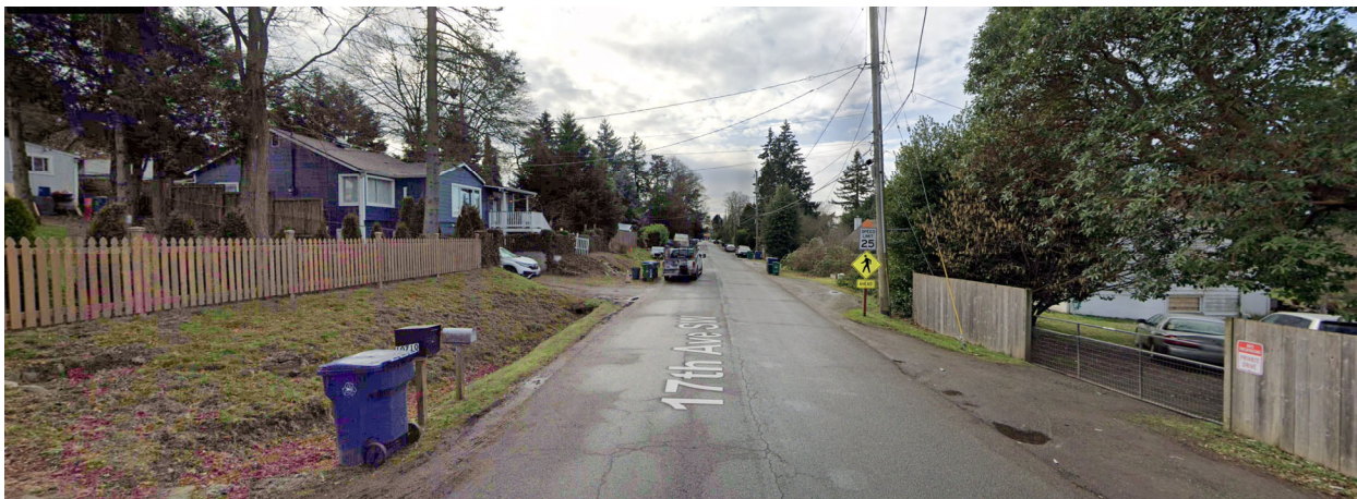
17 th Ave SW near SW 107 th St