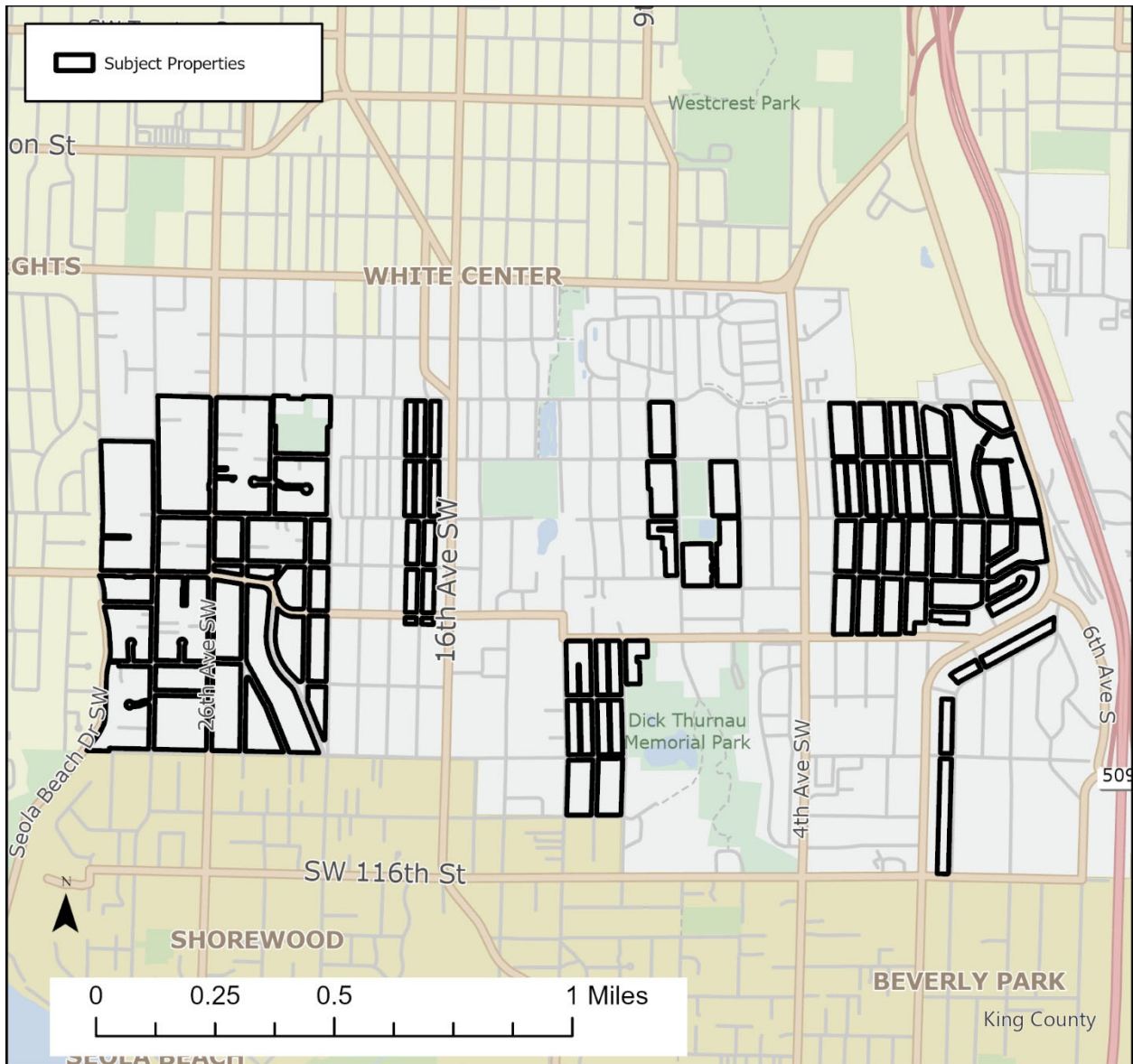
Figure 1 - Vicinity Map

The information included on this map has been compiled by King County staff from a variety of sources and is subject to change without notice. King County makes no representations or warranties, express or implied, as to accuracy, completeness, timeliness, or rights to the use of such information. This document is not intended for use as a survey product. King County shall not be liable for any general, special, indirect, incidental, or consequential damages including, but not limited to, lost revenues or lost profits resulting from the use or misuse of the information contained on this map. Any sale of this map or information on this map is prohibited except by written permission of King County.