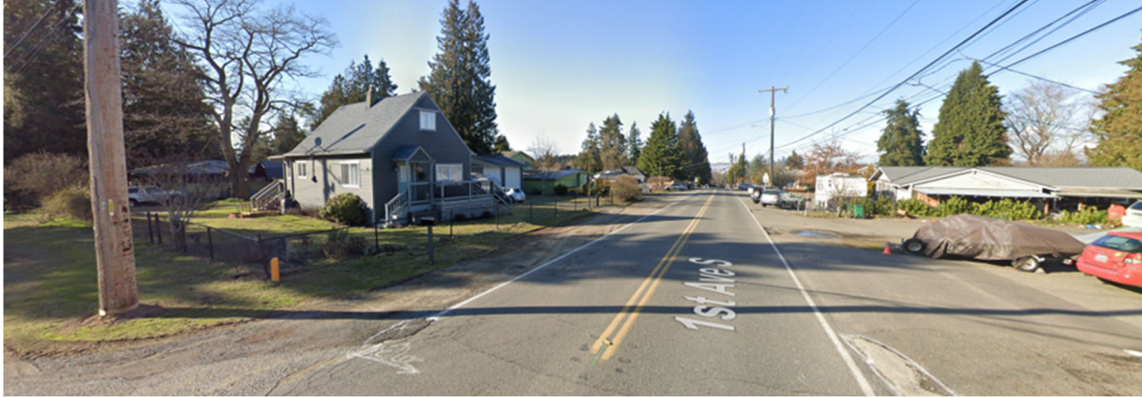
1 st Ave S and S 104th St