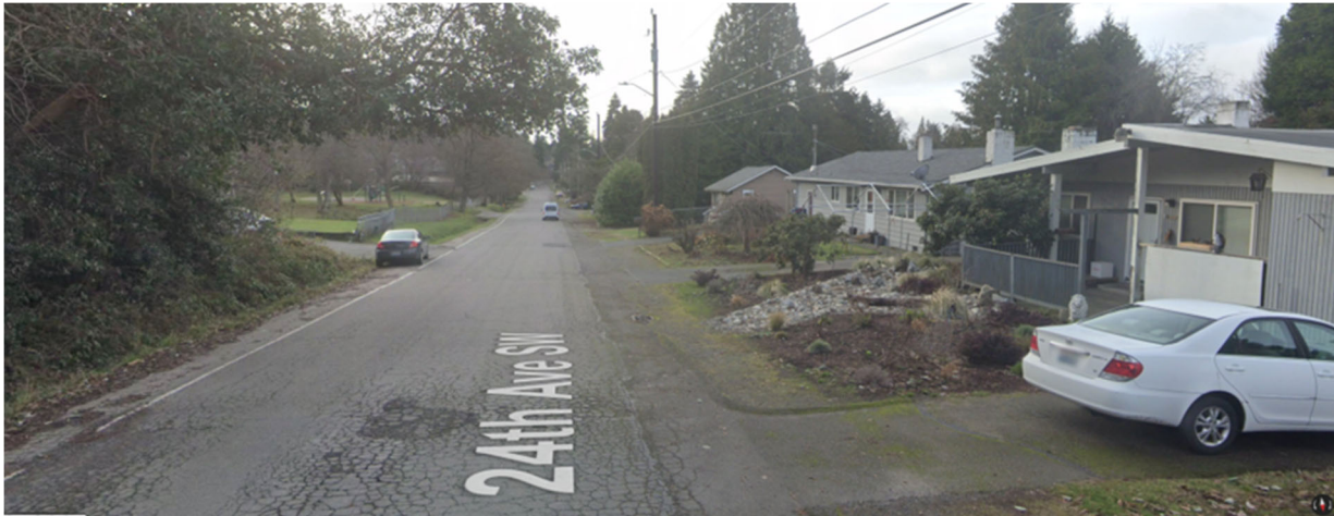
24 th Ave SW near North Shorewood Park