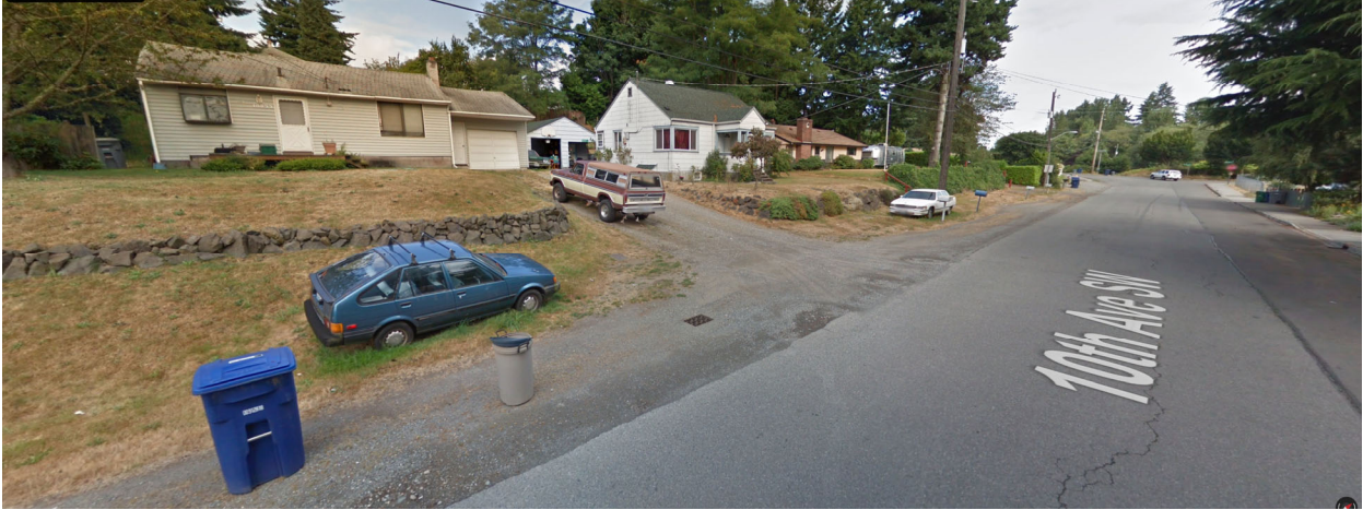
10 th Ave SW near Dick Thurnau Memorial Park