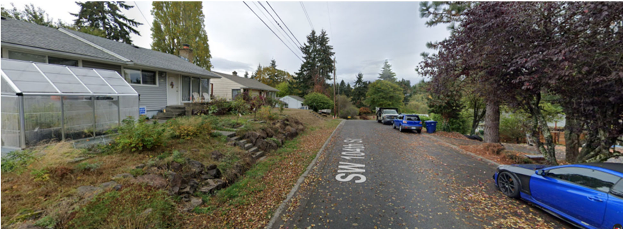
SW 104 th St near White Center Heights Park