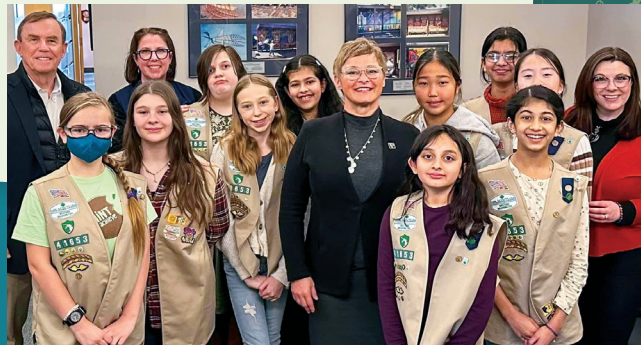
Girl Scout Troop 41653