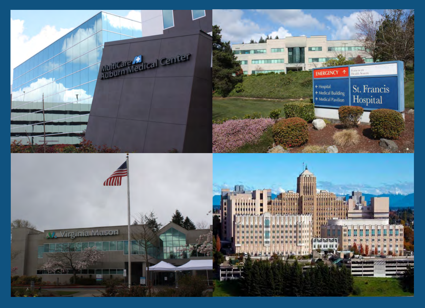
"Prevention is better than cure." - Desiderius Erasmus

"They who have health have hope; and they who have hope have everything." - Middle Eastern Proverb