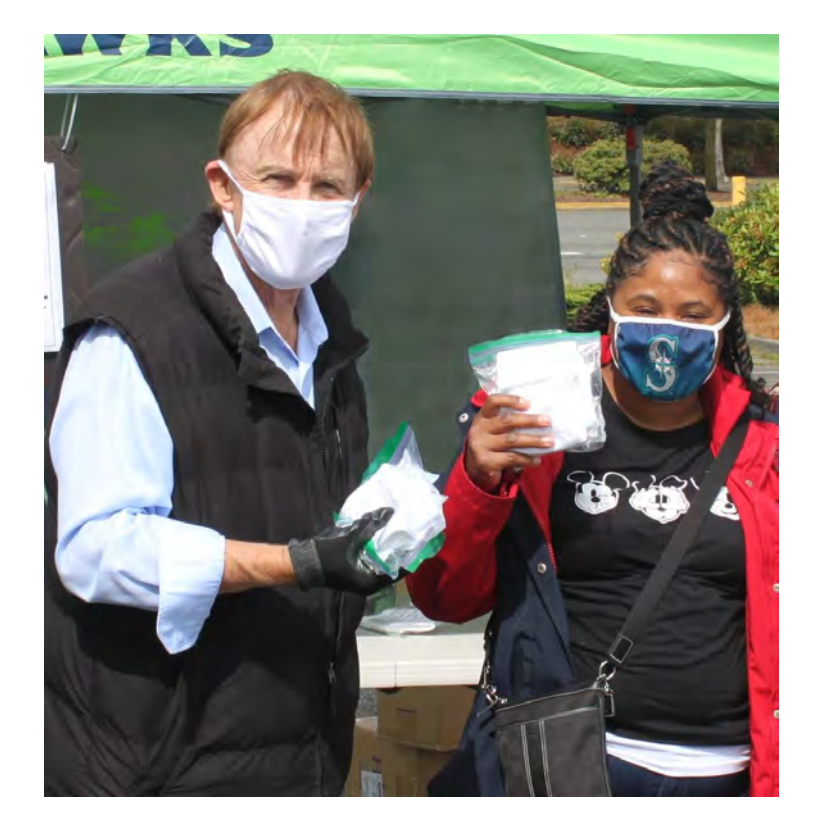
From the outset, we distributed complimentary masks to those who requested them to help prevent the spread of COVID-19 throughout South King County

VA Puget Sound Health Care System - American Lake Division (Pierce County) 9600 Veterans Drive SW Tacoma, WA 98493 (253) 582-8440