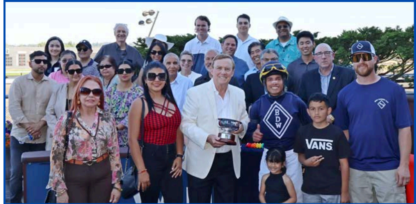
King County Day at Emerald Downs