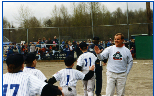
South County Ballfields Opening Ceremony