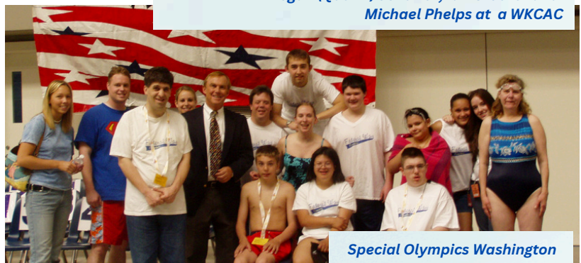
Special Olympics Washington