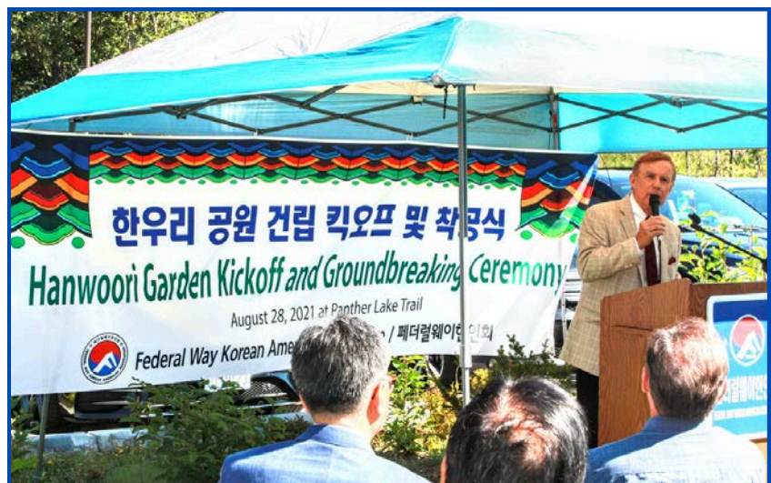
Hanwoori Garden Groundbreaking Ceremony