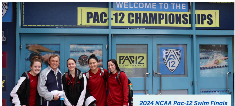
2024 NCAA Pac-12 Swim Finals