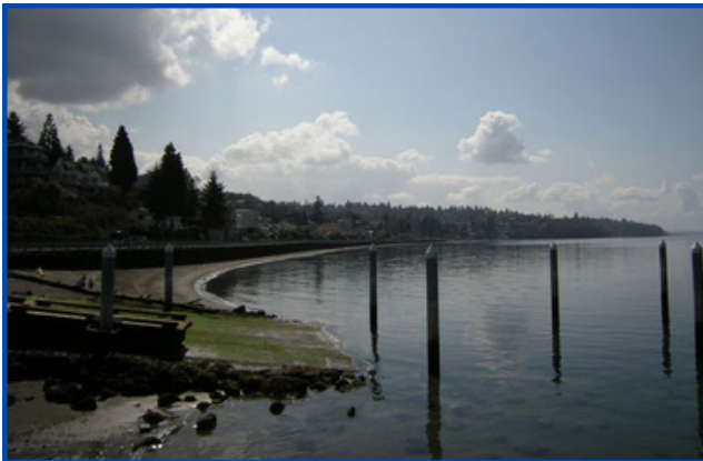
Redondo Boardwalk Washout

PRSRT STD U.S. Postage PAID Seattle, WA Permit No. 1788