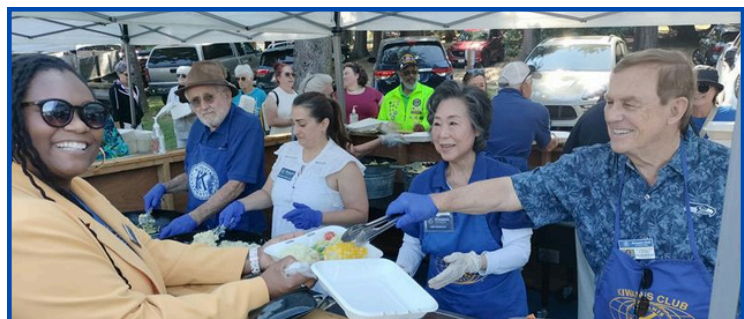
Parks like Steel Lake Park give local non-profits, like the Kiwanis Club of Federal Way, a venue to host events for the whole community. Pictured here is their annual Salmon Bake this summer.

320th to 336th between 1st & 2nd Ave S Federal Way WA 98023