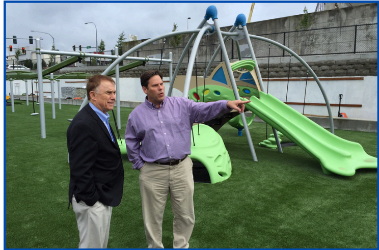
At Town Hall Square Park with Federal Way Mayor Jim Ferrell