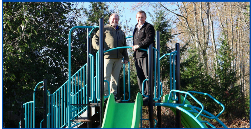
At Milwaukee Park with Pacific Mayor Vic Kave