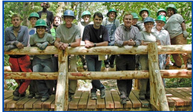
With EarthCorps at Bingaman Pond Natural Area