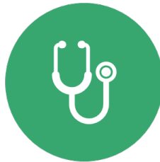
CLINICAL INTEGRATION & ELIMINATION OF ACCESS TO CARE BARRIERS