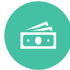
LOCAL + MEDICAID BRAIDED FUNDING MODELS