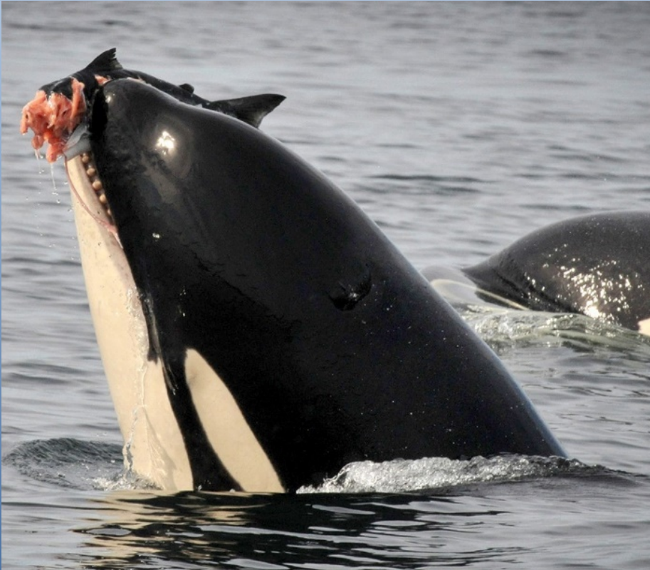
Southern Resident Killer Whale