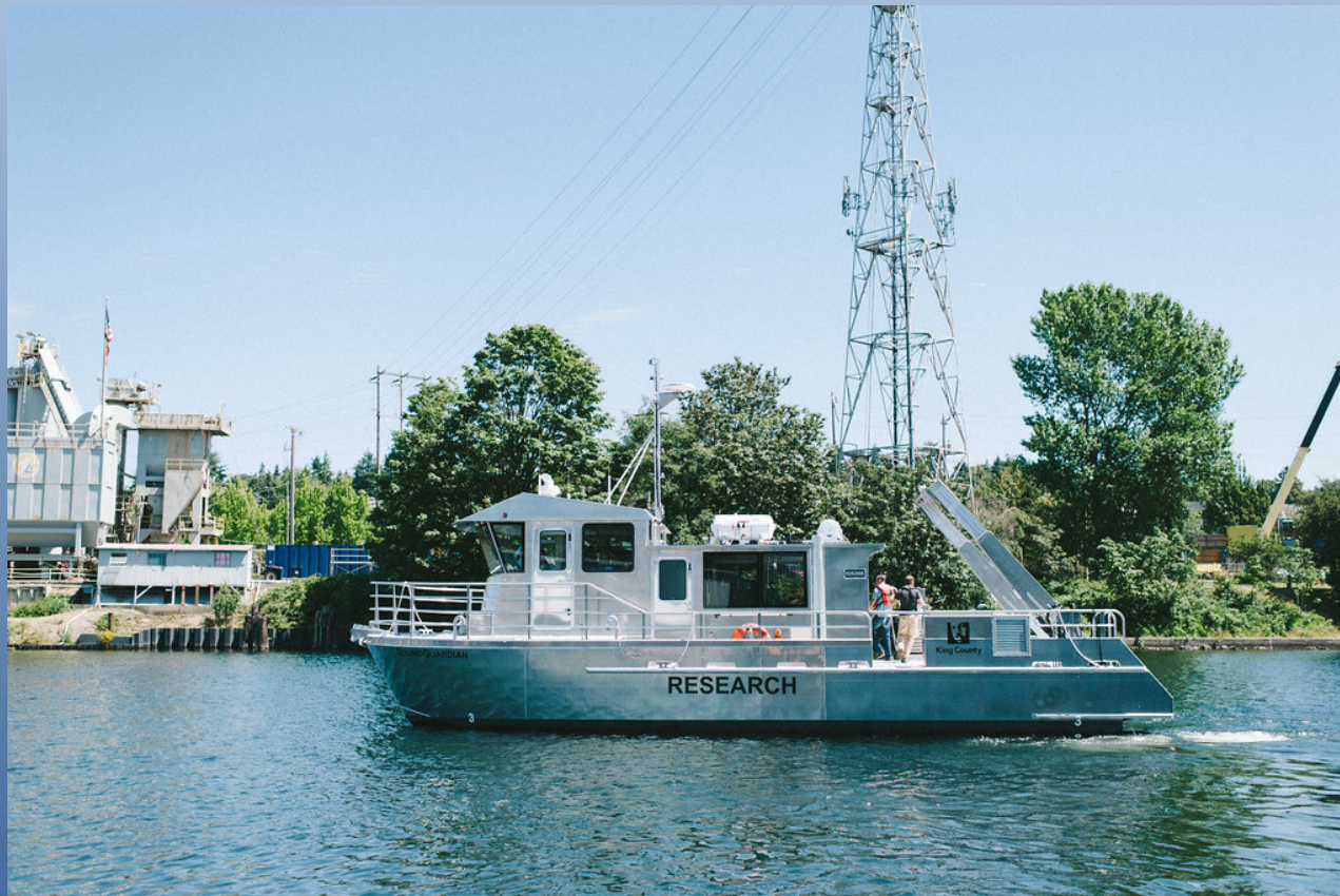
King County's research vessel, the SoundGuardian