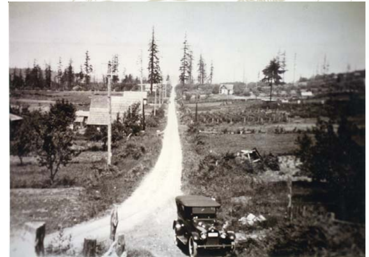
Westside Highway at Colvos, 1923. Used by permission of Vashon-Maury Island Heritage Association, img004-011

Westside Highway proper, as a county road, was constructed in increments between 1891 and 1923. King County road records document these segments—first named after the petitioner or landowner who requested creation of the road. These names included the Langill Road, Thorson Road, Simmons Road, Priest Road, McIntyre Road, and Lamb Road. These newly established