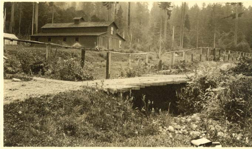
Issaquah-Fall City Road and Kinnear-Ambold Farm, c. 1912.