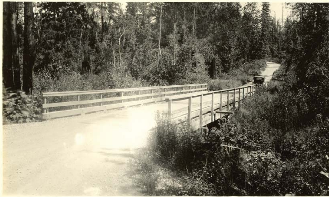
Four miles northeast of Issaquah on Coutts Road, 1932.

(HRI No. 763) and leading into Fall City. Despite these continued extensions and improvements, the road remained basic and rough. A 1912 photograph of the Kinnear property, showing a barn that still stands today, depicts just how primitive it was. Nonetheless, a Kroll map of that same date indicates there were multiple, private ownerships of 40 to 160 acres along the road, as well as larger timber holdings by Weyerhaeuser, Northern Pacific Railroad, and the State of Washington.