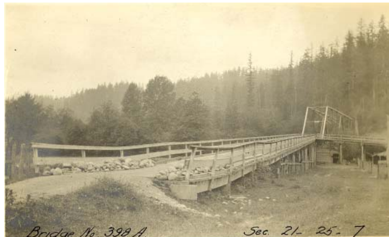
Tolt Bridge over Snoqualmie River, c. 1911.