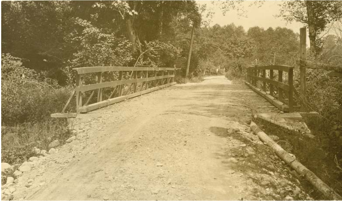
West Snoqualmie Road near Pleasant Hill, c. 1911.