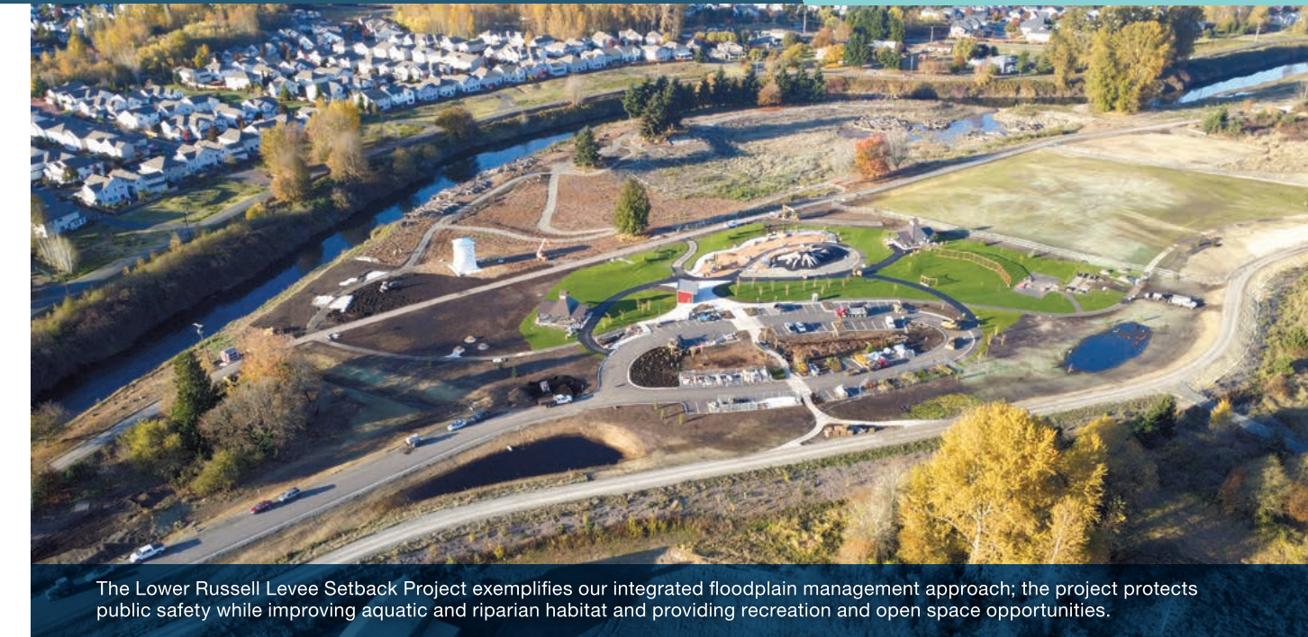
The Lower Russell Levee Setback Project exemplifies our integrated floodplain management approach; the project protects public safety while improving aquatic and riparian habitat and providing recreation and open space opportunities.

kingcountyfloodcontrol.org Reagan.Dunn@kingcounty.gov