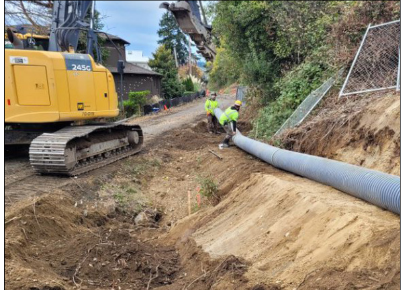
Positioning new drainpipe by hand and with the help of an excavator. This pipe will temporarily divert storm water around work to install a permanent drain line nearby.