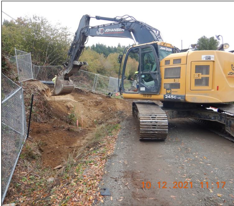
Excavating to upgrade a drain line that conveys storm water under the trail.