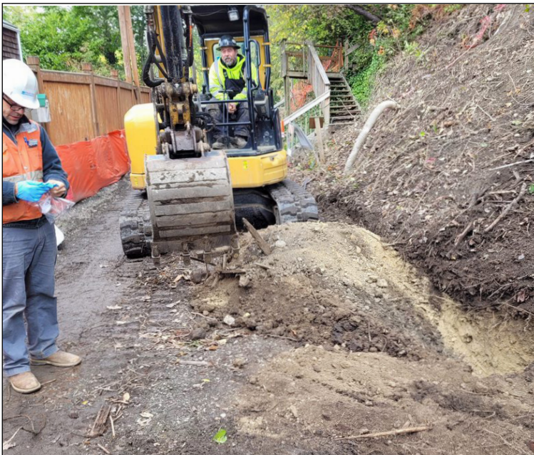
An excavator begins to dig for a retaining wall footing while the project geologist examines the uncovered soil.