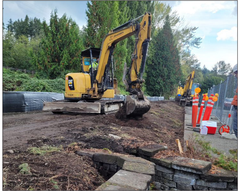
Grubbing the edge of the trail to prepare the site for a new retaining wall.