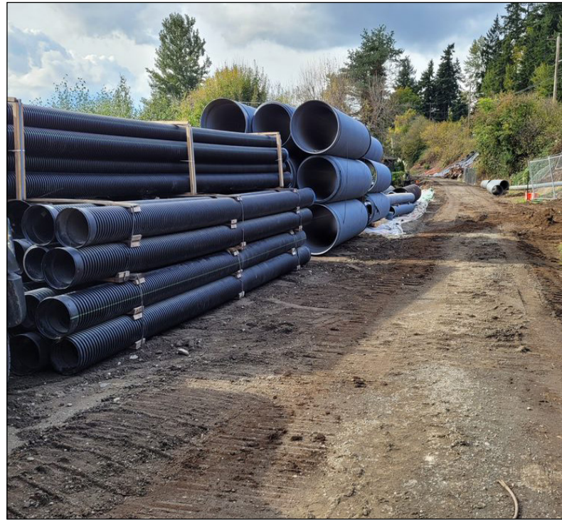
Recently delivered drain pipe to be used on the multiple drainage systems along the trail.