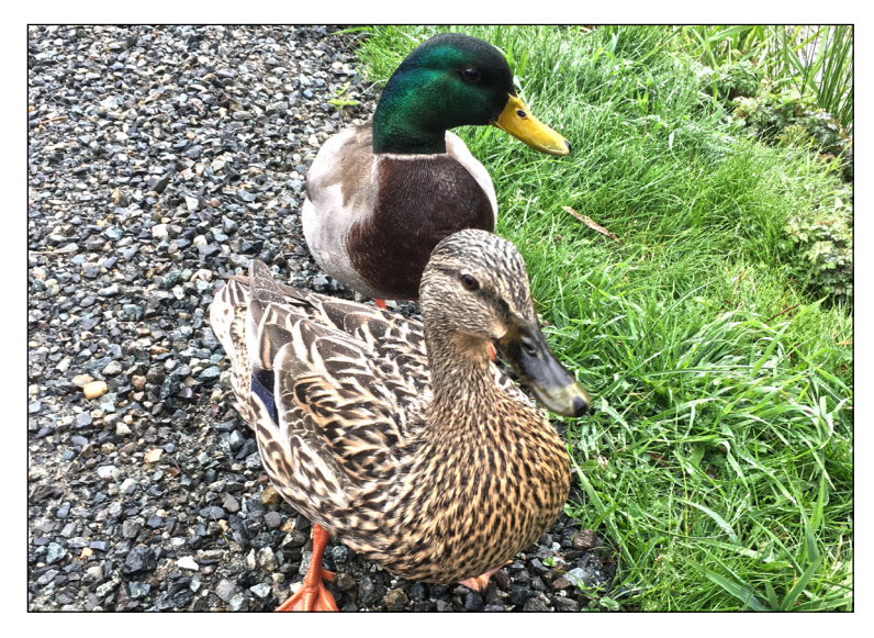
Trail design and construction includes expanded and improved wildlife habitat along the corridor.

February 5, 2021 – Advertised South Sammamish B – Phase 1 Construction Contract