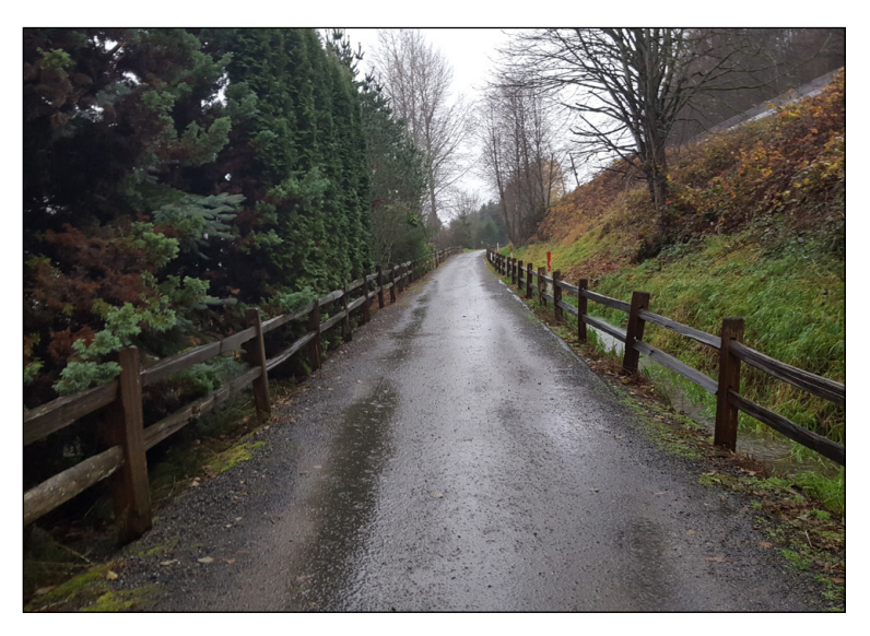
Construction beings in May, and will replace the last gravel trail segment...

• February 5, 2021 – Advertised South Sammamish B – Phase 1 Construction Contract