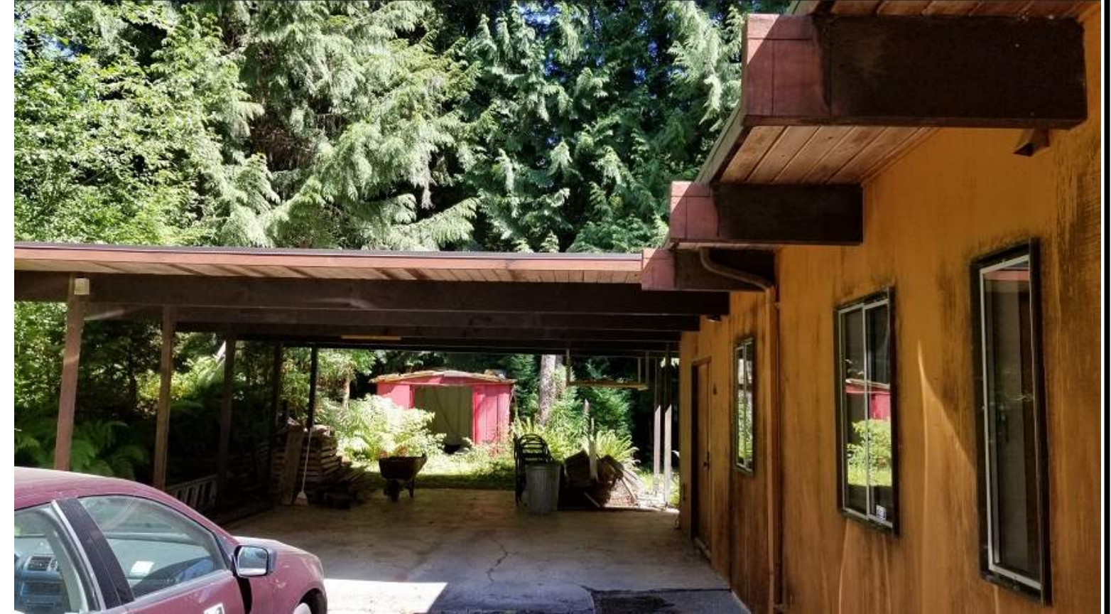
Residence House, Carport, Concrete Pad, Shed