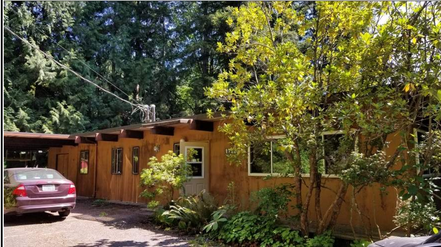
Residence House, Concrete Driveway