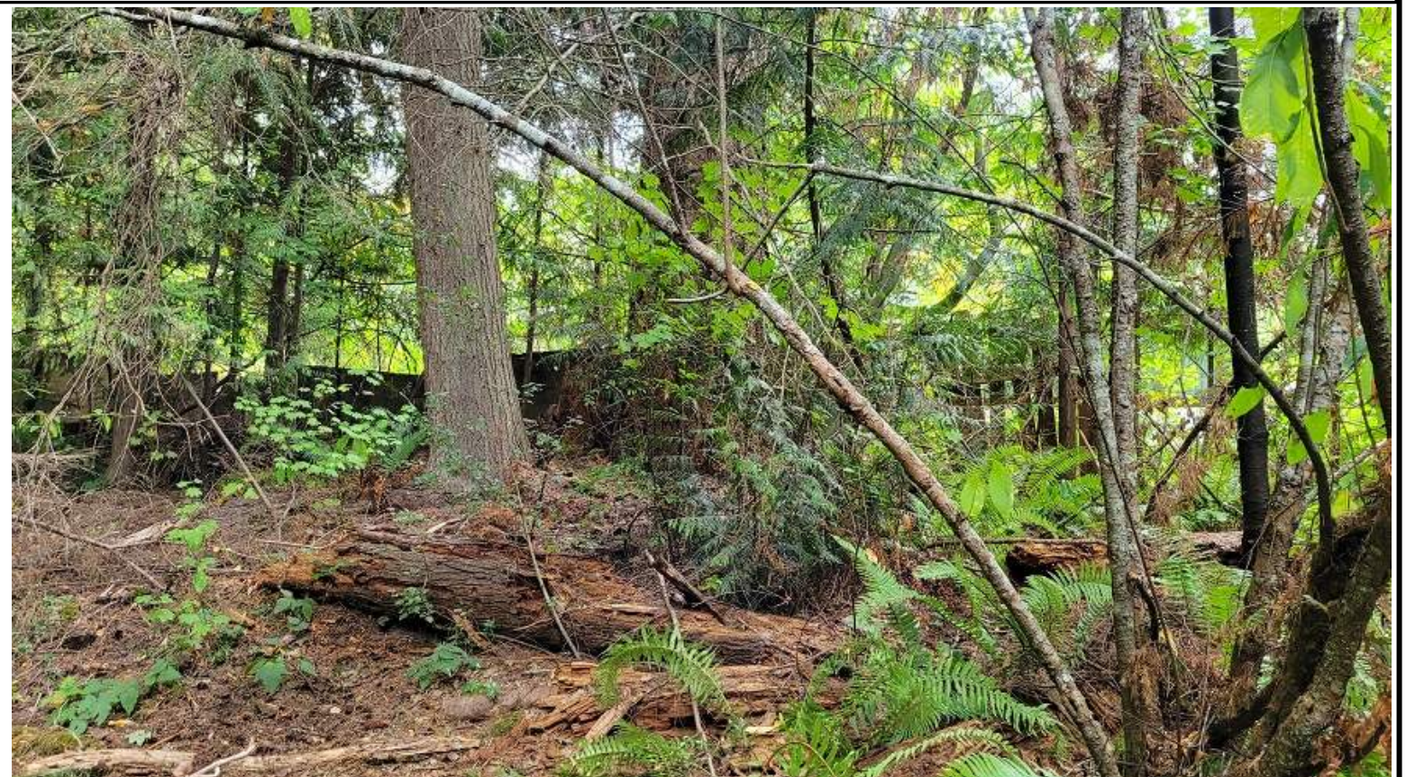
Wood Fence & Posts