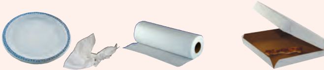
Paper plates, paper napkins, paper towels