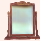
Windows and mirrors