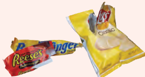
Candy wrappers, chip bags