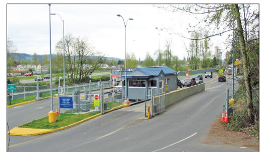
Entrance to the station