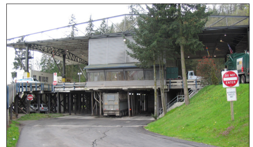
Refuse trailers located below tipping floor