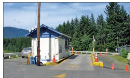
Cedar Falls scalehouse: one scale is used for in and outbound traffic