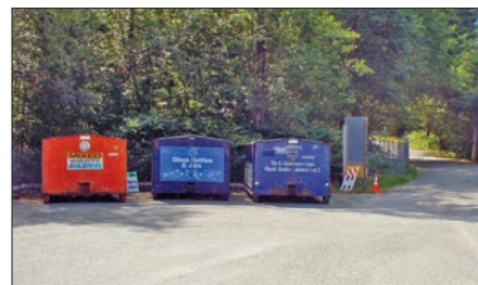
Recycling drop boxes

*These materials must be recycled at facilities that accept these materials for recycling.