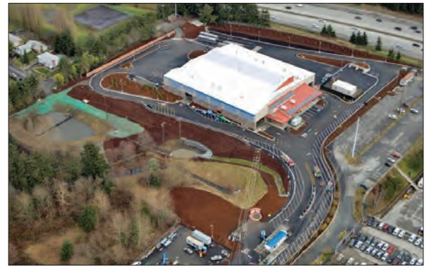
Aerial view of the Shoreline Transfer Station

* These materials must be recycled at facilities that accept these materials for recycling.