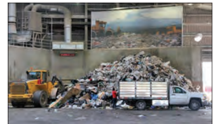
Mount Rainier overlooks a mountain of garbage at the Regional Cedar Hills Landfill