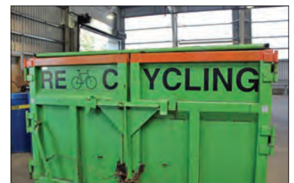
Bicycle recycling receptacle