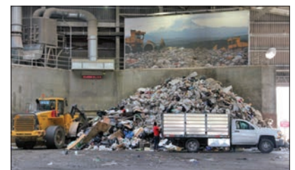
Mount Rainier overlooks a mountain of garbage at the Regional Cedar Hills Landfill