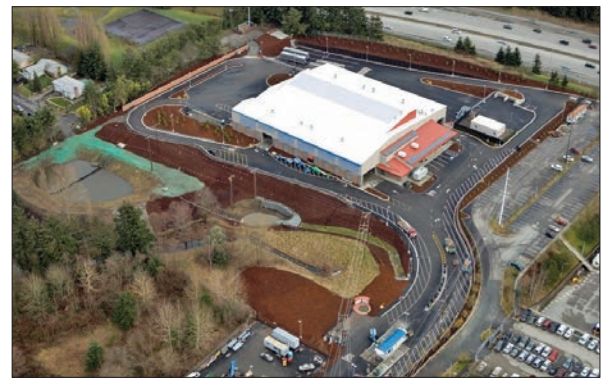
Aerial view of the Shoreline Transfer Station

* These materials must be recycled at facilities that accept these materials for recycling.