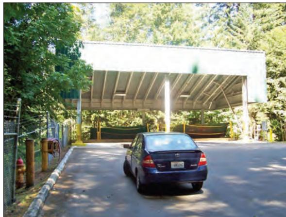
Disposal area (4 stalls) exterior gate to the Skykomish Drop Box