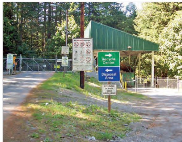
Signs direct customers to the Recycle Center or Disposal Area

Recyclable materials are separated by type and distributed to local, national or international markets for processing into recycled content products.