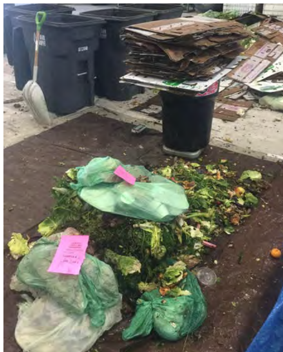
Figure 2. Material in Samples

After the crew extracted each sample, the collected contents were placed into 96-gallon carts (Figure 3). The field manager checked the weight of each sample using a pre-calibrated scale. If judged to be too light, additional material was pulled from the same cell area until the desired weight was achieved. Samples determined to be excessively heavy were reduced by removing a homogenous slice of material from the cart.