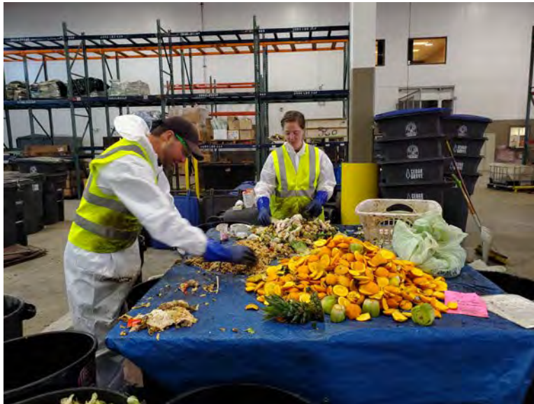
Figure 5. Sample Sorting

Sorted materials were placed in plastic laundry baskets or barrels for weighing and recording (Figure 6).