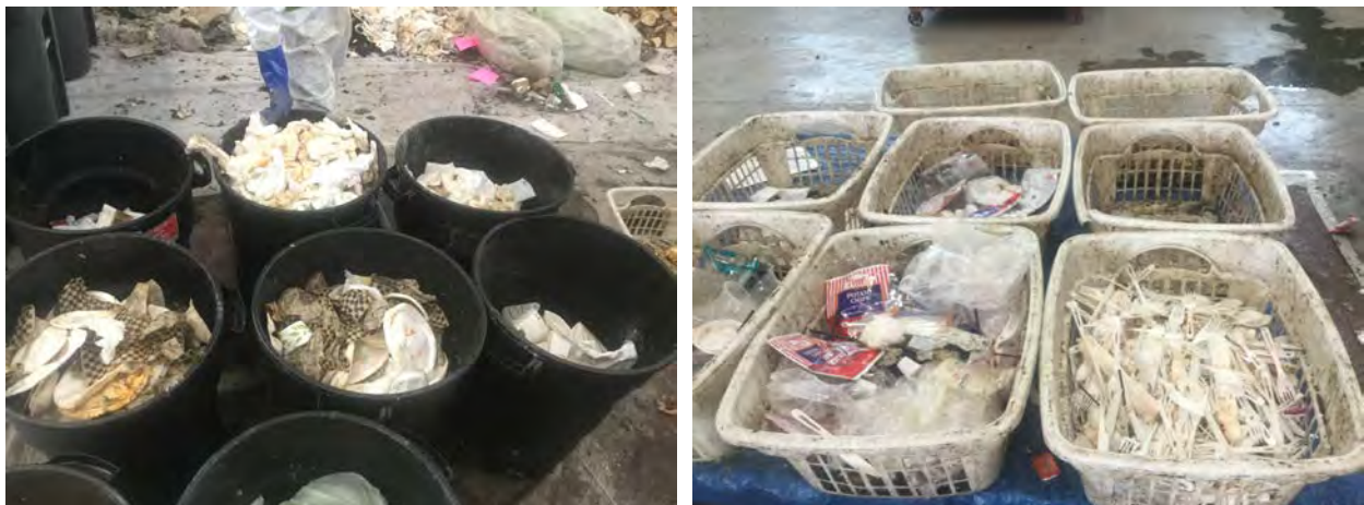
Figure 6. Sample Post-Sorting

Sorted materials were placed in plastic laundry baskets or barrels for weighing and recording (Figure 6).