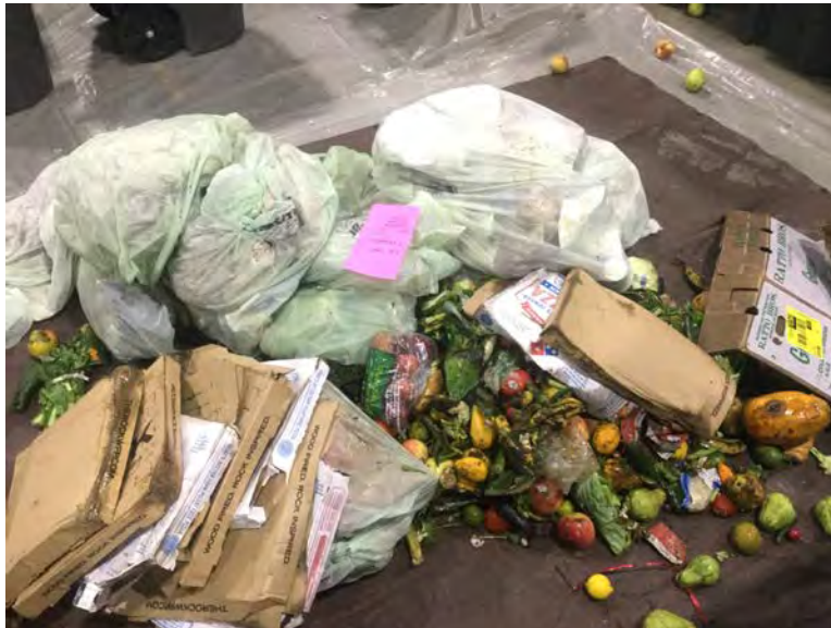
Figure 4. Extracted Sample with Sample ID

For sorting, the sample carts were emptied onto a tarp, one sample at a time. The sample identification placard was placed on the emptied material and the sample was photographed (Figure 4).