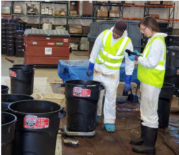
Figure 7. Sample Weighing

The field manager verified the purity of each component as it was weighed and recorded on a digital sampling form on Cascadia’s cloud-based database management system, OSCAR (Online Statistical Composition Analysis Repository), customized for this study (Figure 8).