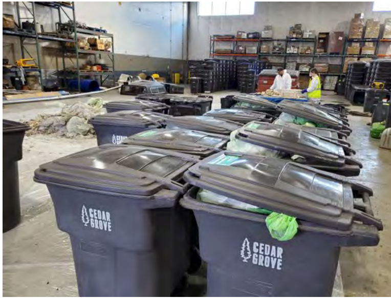
Figure 3. Samples Extracted in 96-gallon Toters